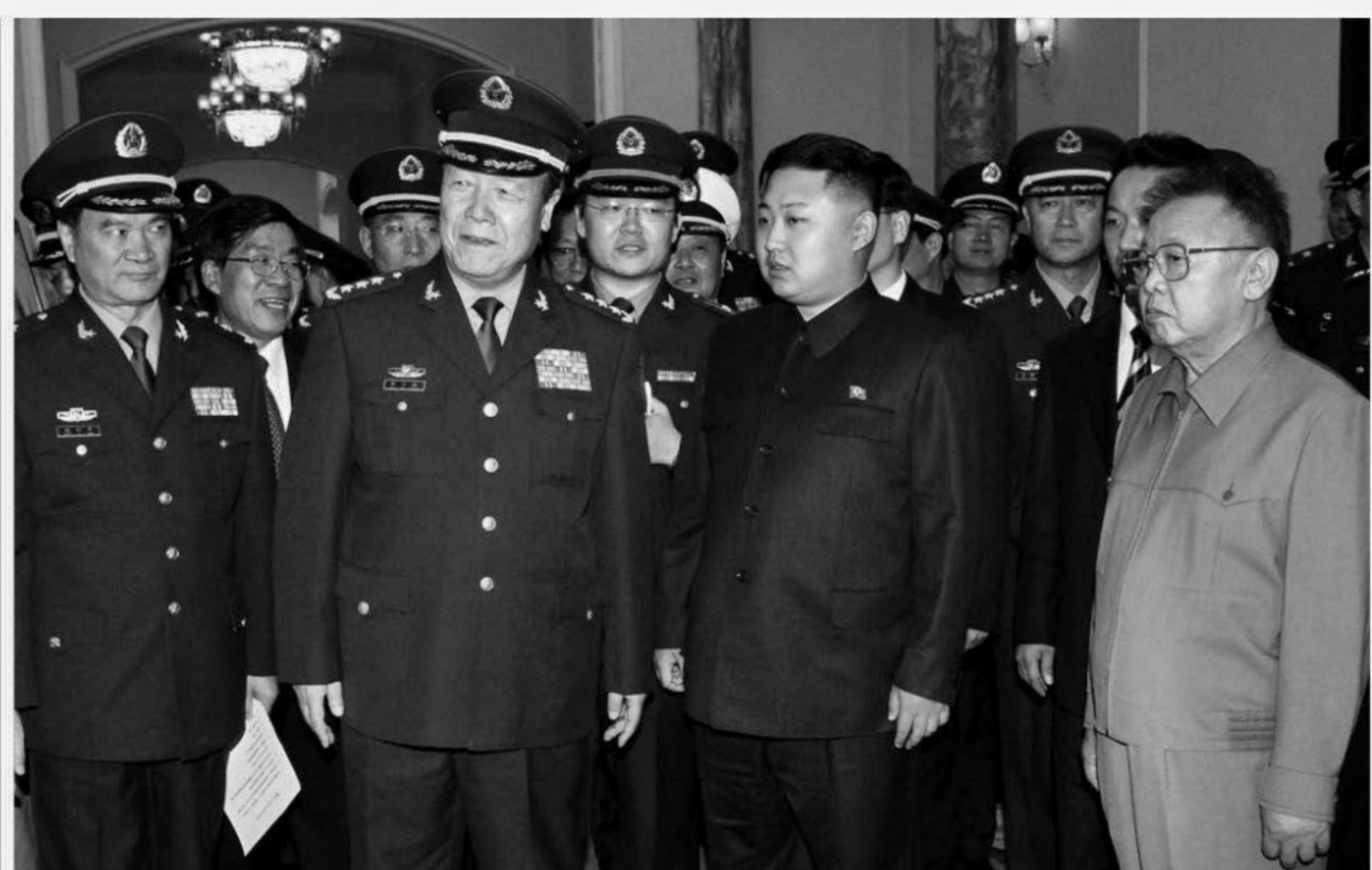
This photo released by North Korea's official Korean Central News Agency (KCNA) yesterday shows North Korean leader Kim Jong-il (2nd R) and his son Kim Jong-un (C) meeting with a group of Chinese officers, led by Guo Boxiong (2nd L), vice chairman of China's Central Military Commission, during a visit to Pyongyang on Monday.