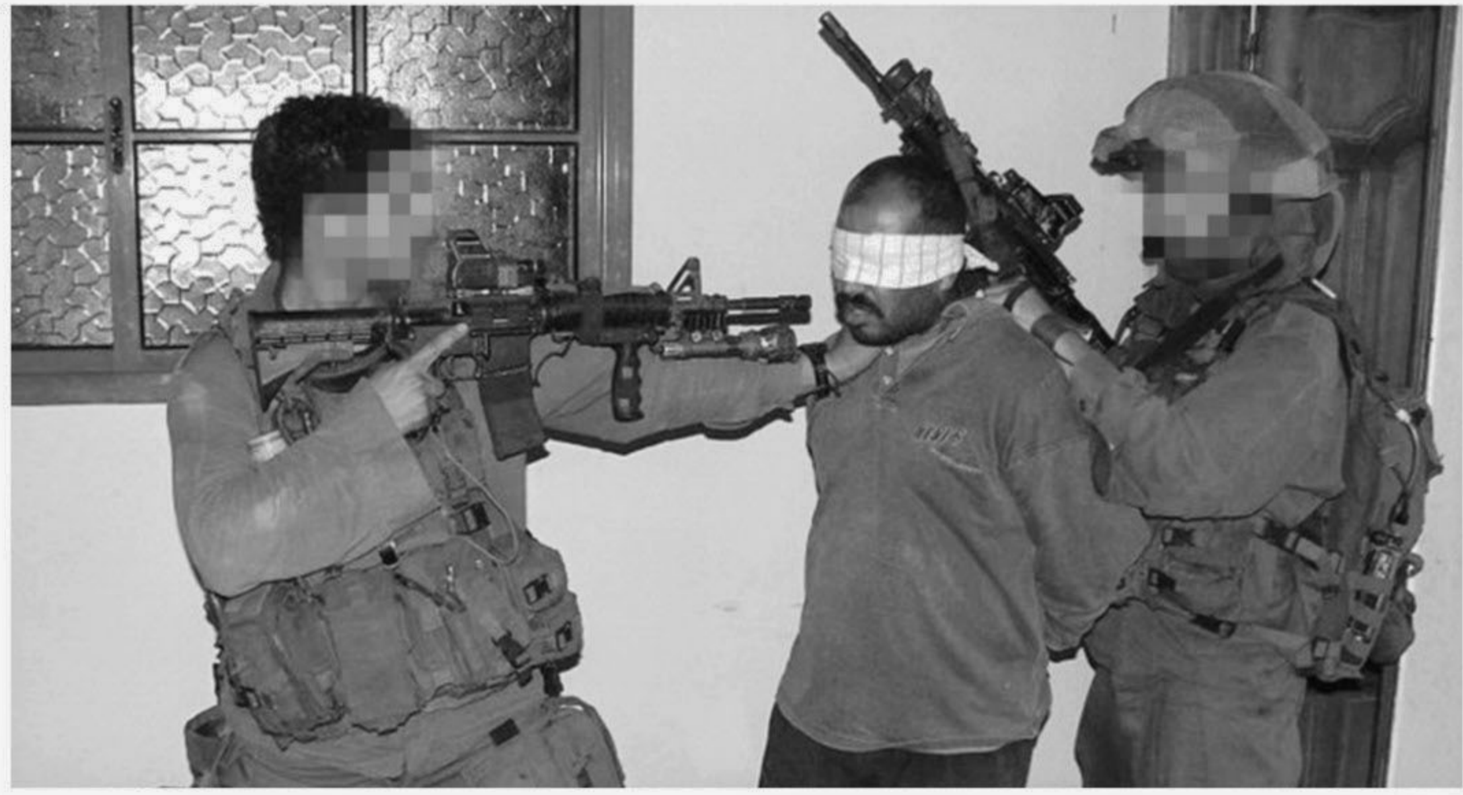
A handout picture obtained yesterday by AFP from the Israeli human rights organization Breaking the Silence allegedly shows an Israeli soldier pointing his assault rifle at the face of a blindfolded detainee at an undisclosed location. Breaking the Silence, a group of Israeli veteran combat soldiers who collect testimonies and photos of troops who have served in the Palestinian territories, published new photos of soldiers posing with detainees and vandalising Palestinian homes that appear to have been taken during the 2008-2009 Israeli "Operation Cast Lead" in the Gaza Strip.

The Dalai Lama, who wound up his three-day visit here by leading prayers at the newly opened Tibetan cultural centre, doesn't rule out a female successor. The purpose of the Dalai Lama's reincarnation is to serve the Buddha, the 14th Dalai Lama told a week-end audience of more than 15,000 at the city's Rogers Centre. "If a female reincarnation is more useful - why not?" he retorted when asked if the next Dalai Lama could be a female. In his typical jovial style, he explained the two advantages of having a female Dalai Lama. The first advantage, he said, is that females are "biologically more sensitive about others' pain" than males. The other advantage of having a female Dalai Lama is that she would be a lot more attractive than him, he said amid peels of laughter.