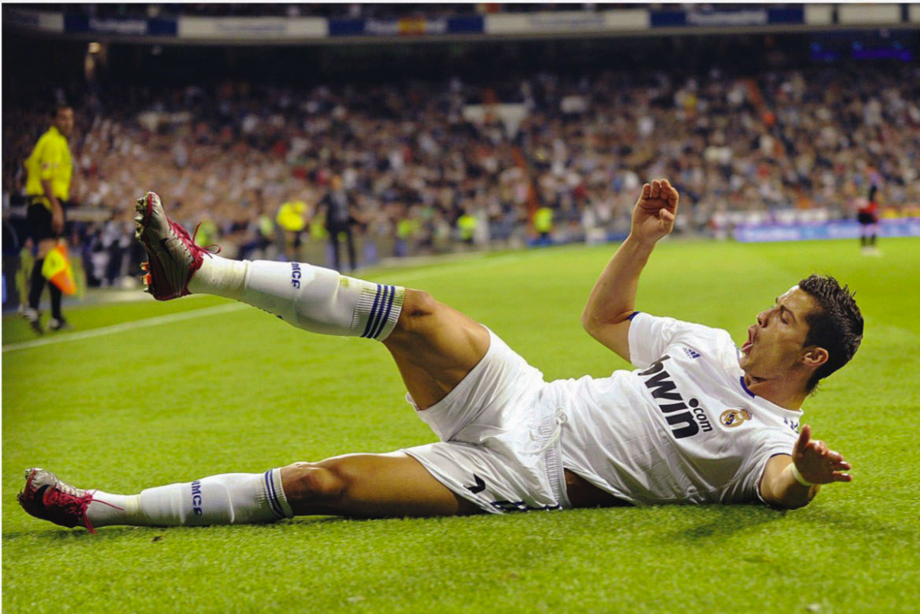
Real Madrid superstar Cristiano Ronaldo celebrates in style one of his quadruple against Racing Santander in their La Liga clash at the Bernabeu on Saturday.