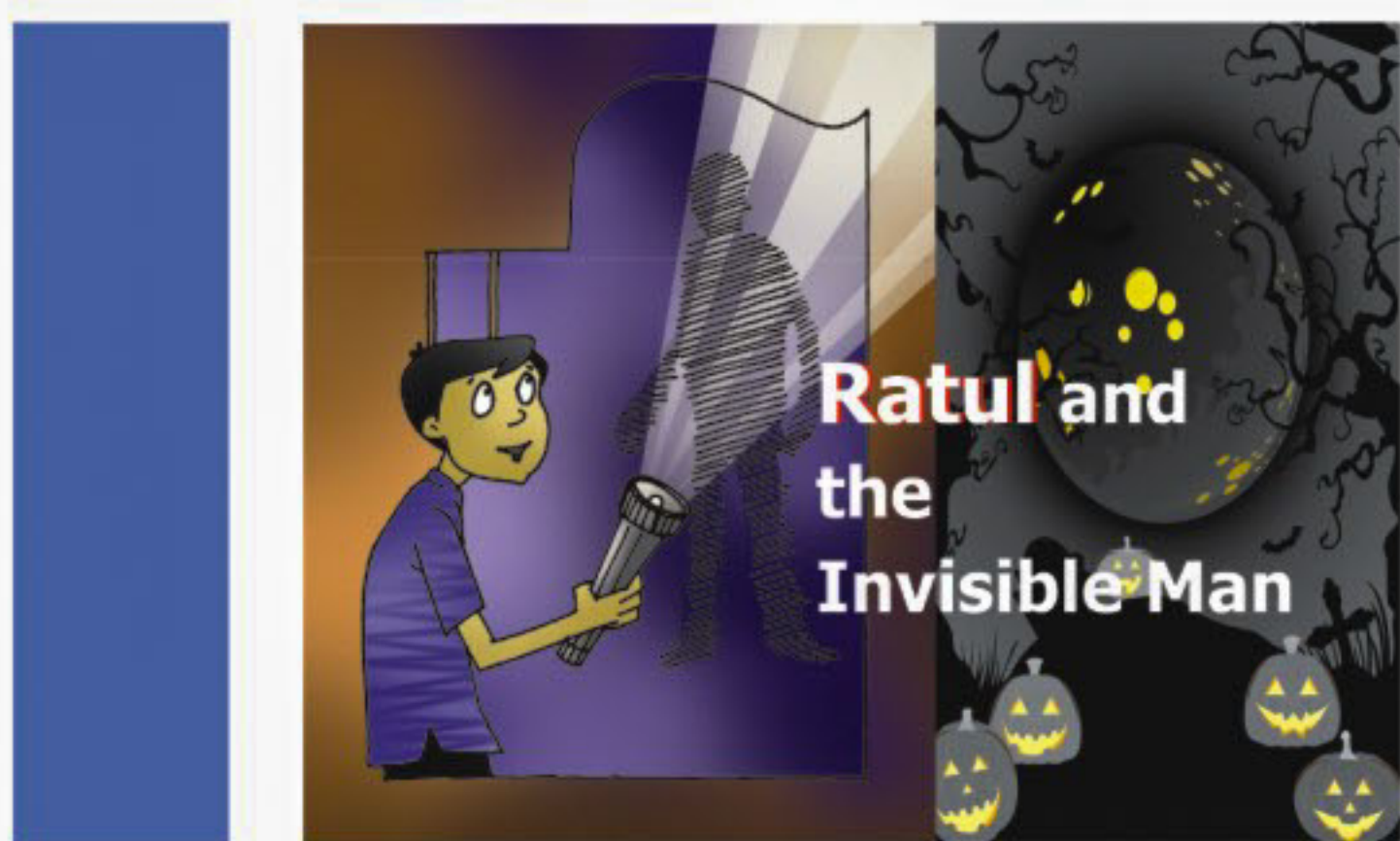
Illustration : Yousuf Ali Khan Hira