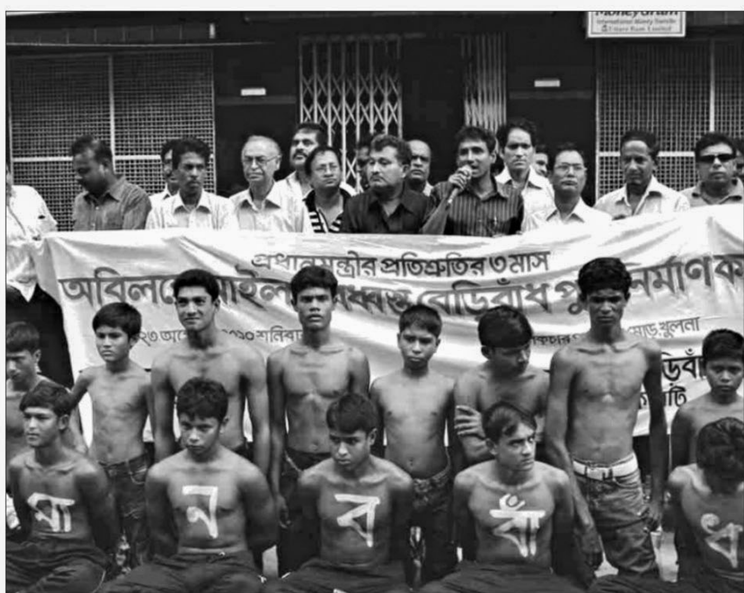
People of Aila-affected areas form a human chain at Picture Palace Cinema intersection in Khulna city yesterday demanding immediate steps for construction of embankments to save them from recurrent flooding and waterlogging.