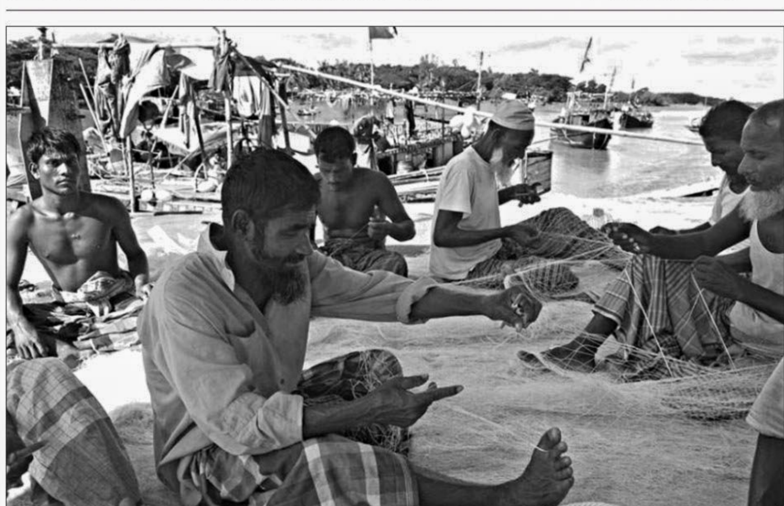
Fishermen, having a spare time during the 10-day ban on catching hilsa, repair their fishing nets at Mohipur in Kuakata of Patuakhali district yesterday.