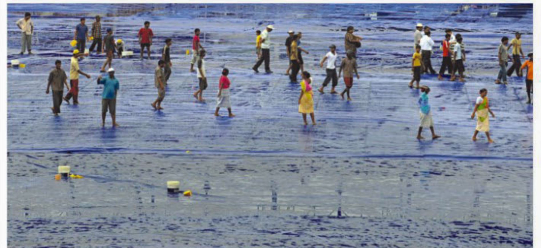
IT'S NOT GOA'S SEA BEACH: Ground staff walk through water at the Jawaharlal Nehru Stadium at Margao in Goa yesterday. Heavy overnight and morning rains created the water logging at the venue where India and Australia are scheduled to the third and final one-day international today.