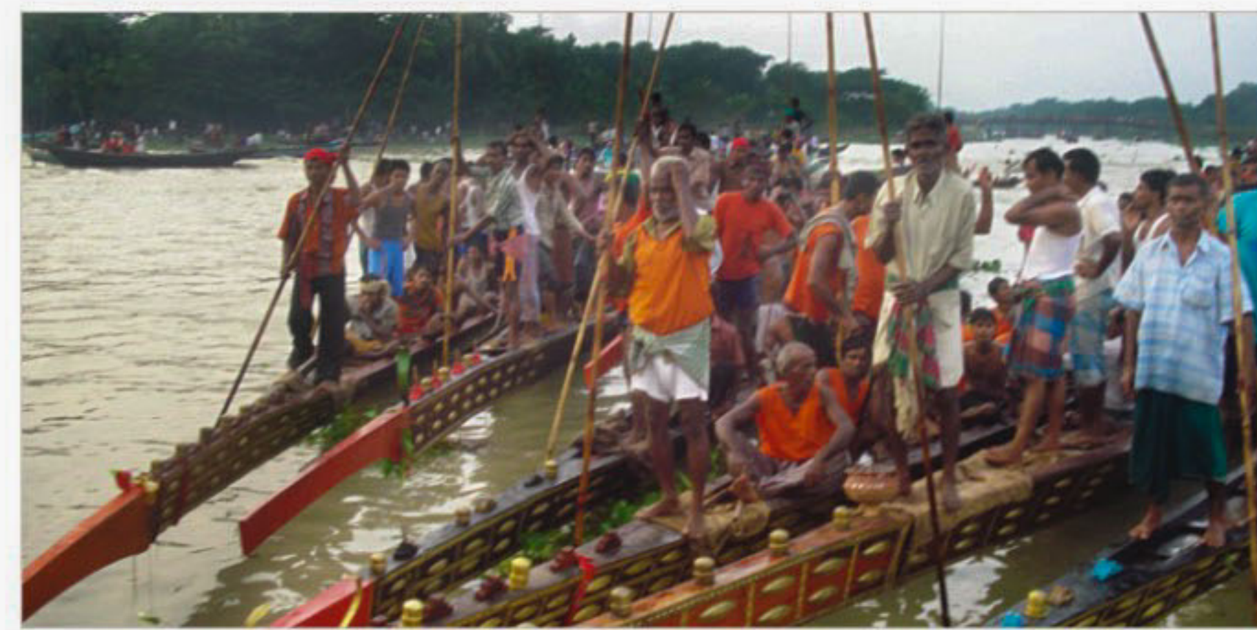
The boat race attracts people from a spectrum of communities every year.

While people greeted the winners with a loud round of applause, the event was marred by the recent sinking of a trawler named 'Maer Doa'. Three corpses were recovered from the trawler, a tragic sight without a parallel in the 150-year-history of boat racing here.