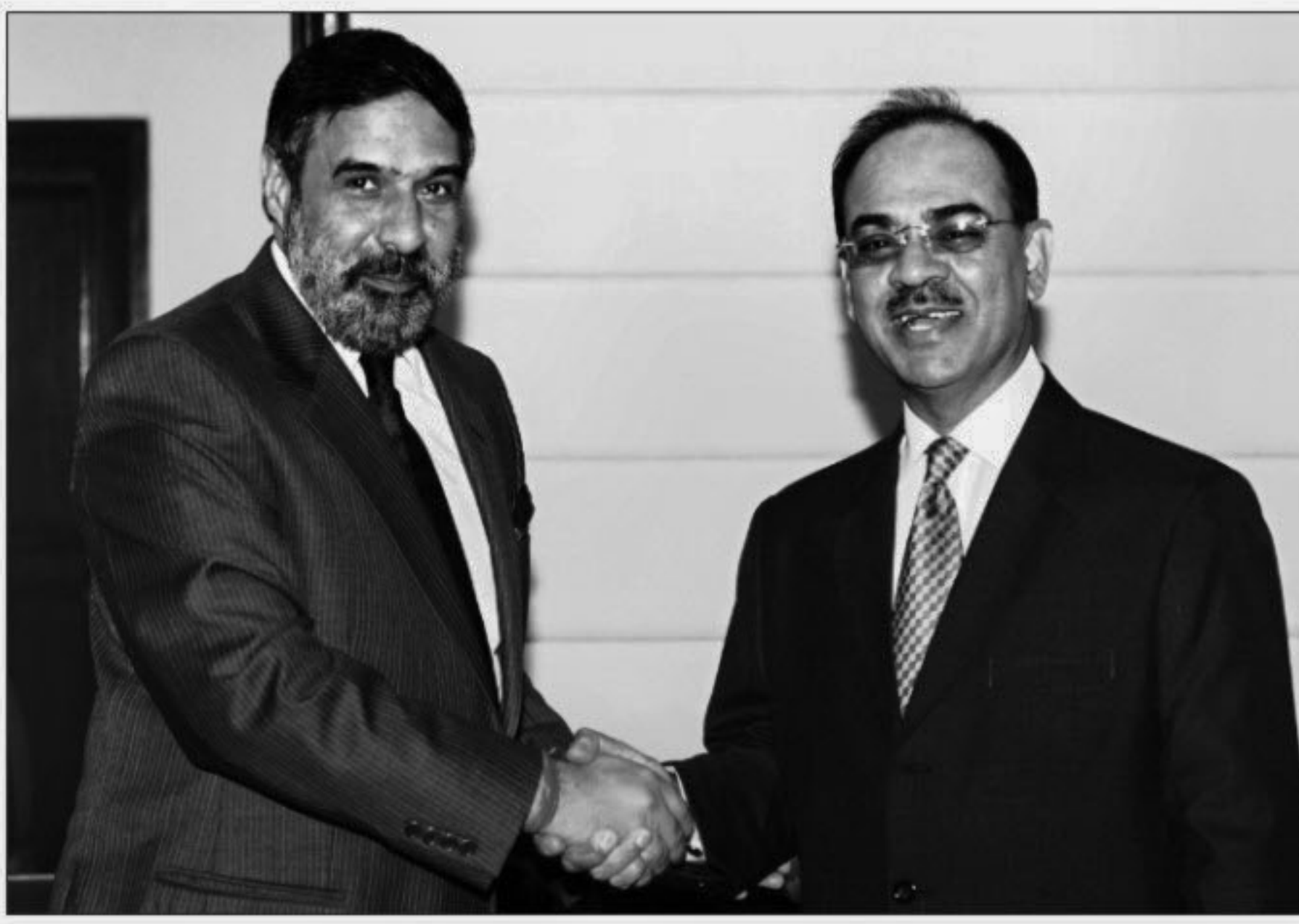
Bangladesh Commerce Minister Faruque Khan shakes hands with his Indian counterpart Anand Sharma at the Indian Commerce Ministry office in New Delhi yesterday after signing a Memorandum of Understanding to start two border haats. (Story on Page 1)