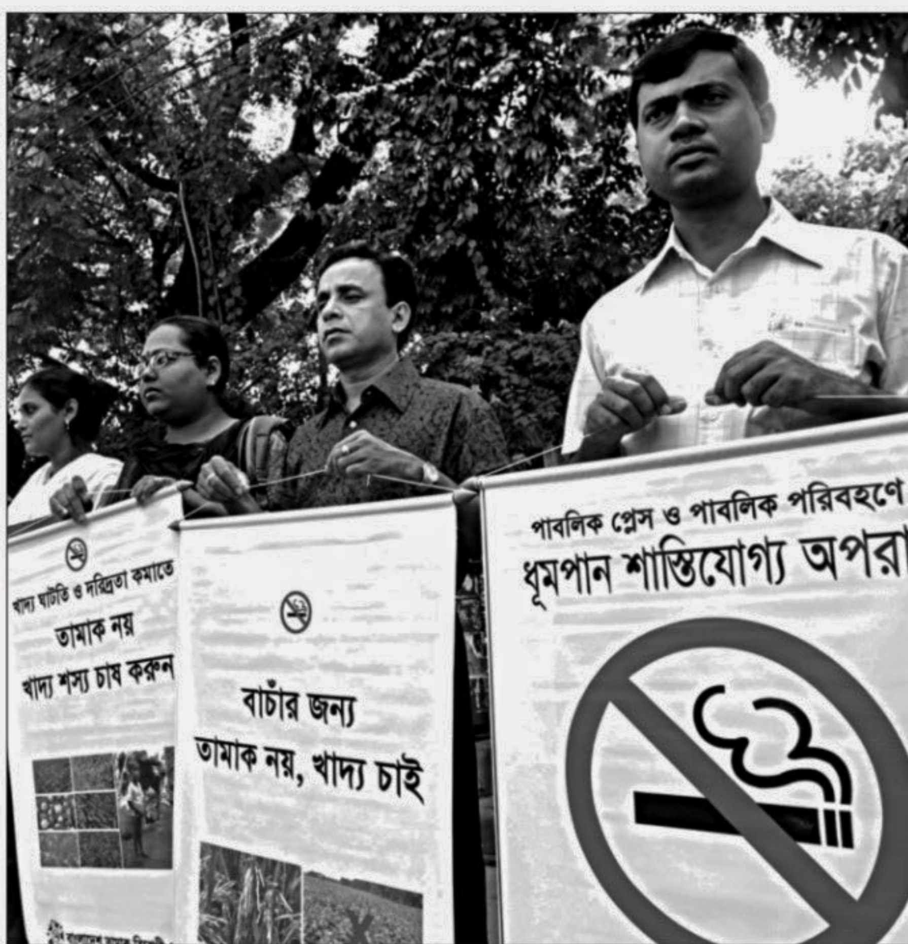
Bangladesh Anti-Tobacco Alliance forms a human chain in front of the National Press Club in the city yesterday demanding an end to the cultivation of tobacco to ensure food security.