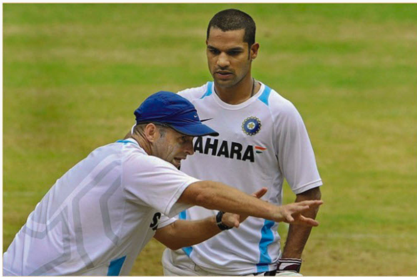
India coach Gary Kirsten (L) gives newcomer Shikhar Dhawan some batting lessons during a training session at the Jawaharlal Nehru ground in Goa yesterday.