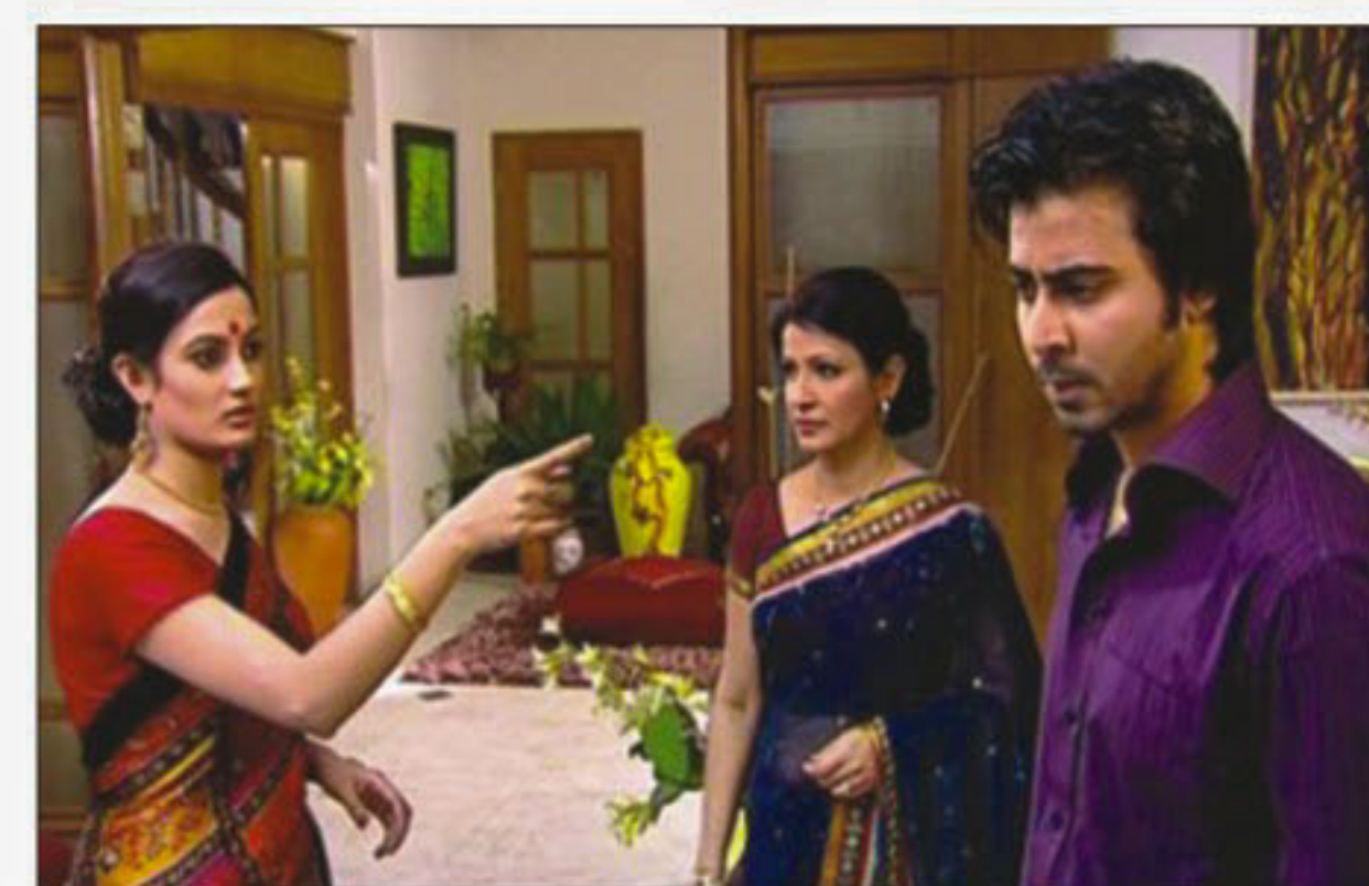
A scene from the serial.