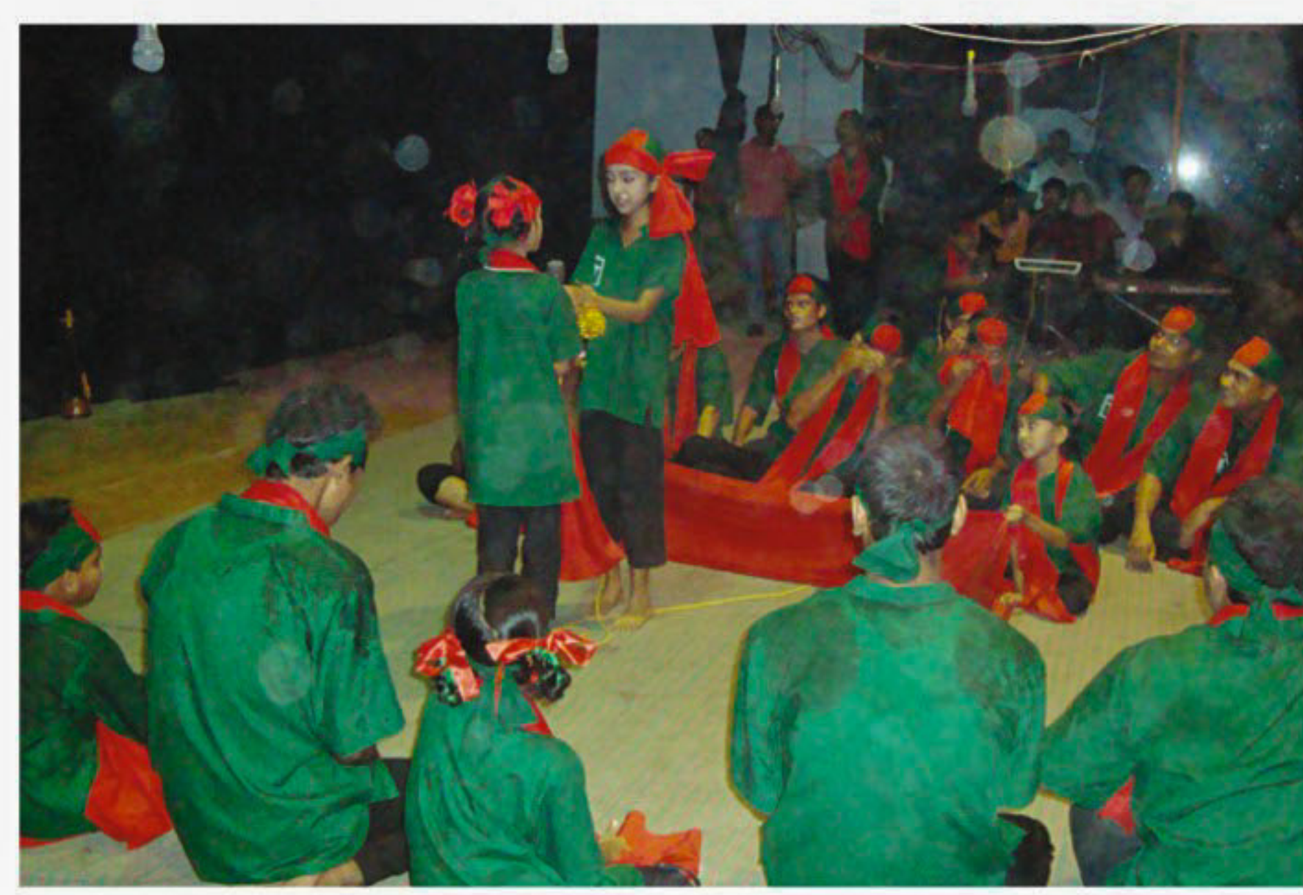
Actors of Jhenidah Theatre in the play "Jolbau Paribartan Ebong..."