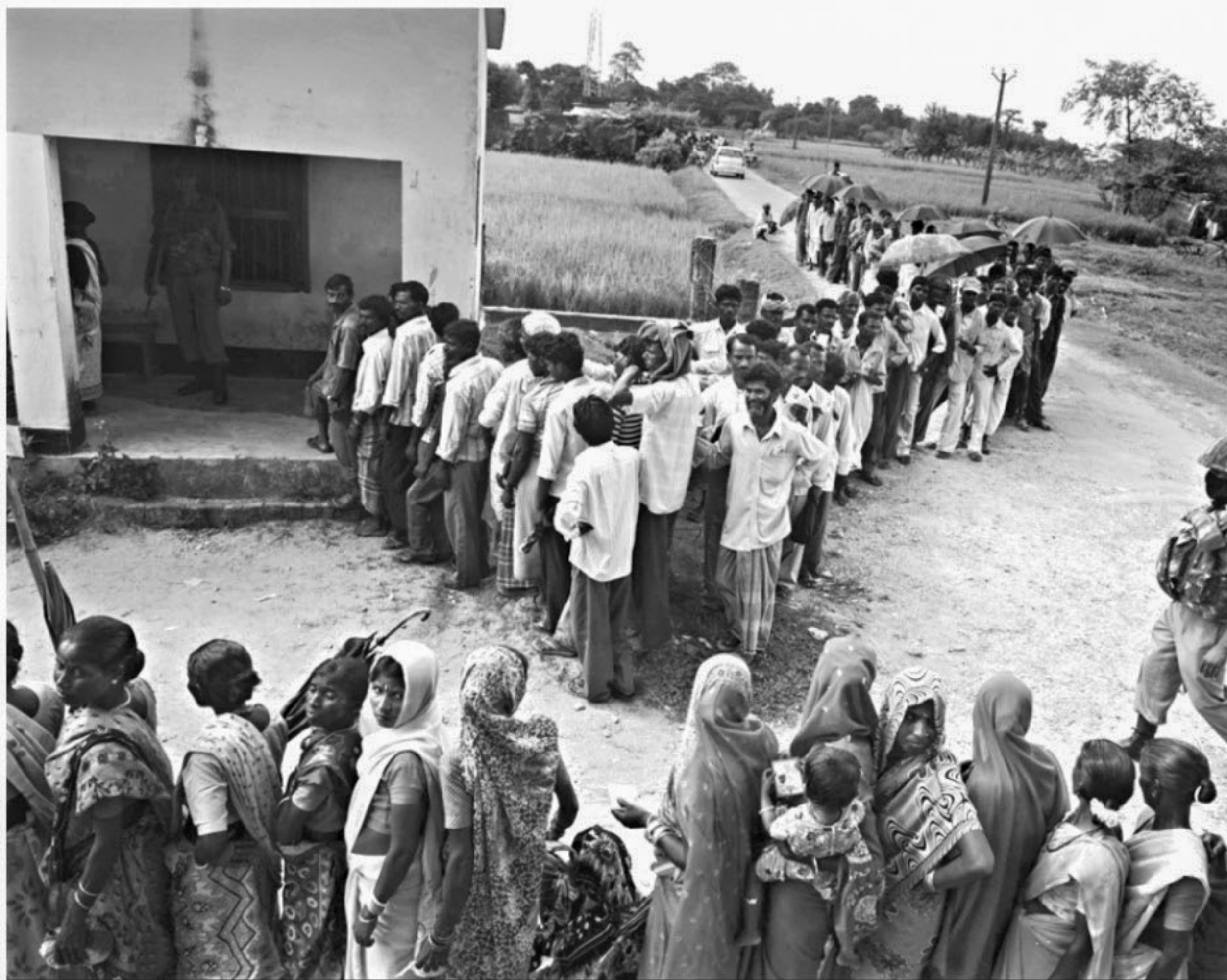
Voters queue outside a polling station in Thakurganj village in India's Bihar state yesterday. Moderate voting was reported in the first phase of Bihar state assembly elections where polling began in 47 constituencies across the Kosi-Seemanchal and Mithilanchal belts.