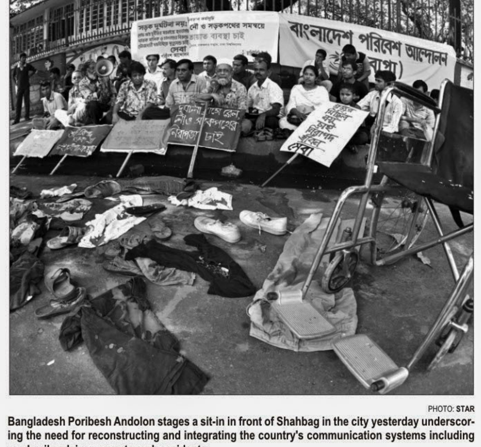
Bangladesh Poribesh Andolon stages a sit-in in front of Shahbag in the city yesterday underscoring the need for reconstructing and integrating the country's communication systems including road, rail and river ways, to curb accidents.