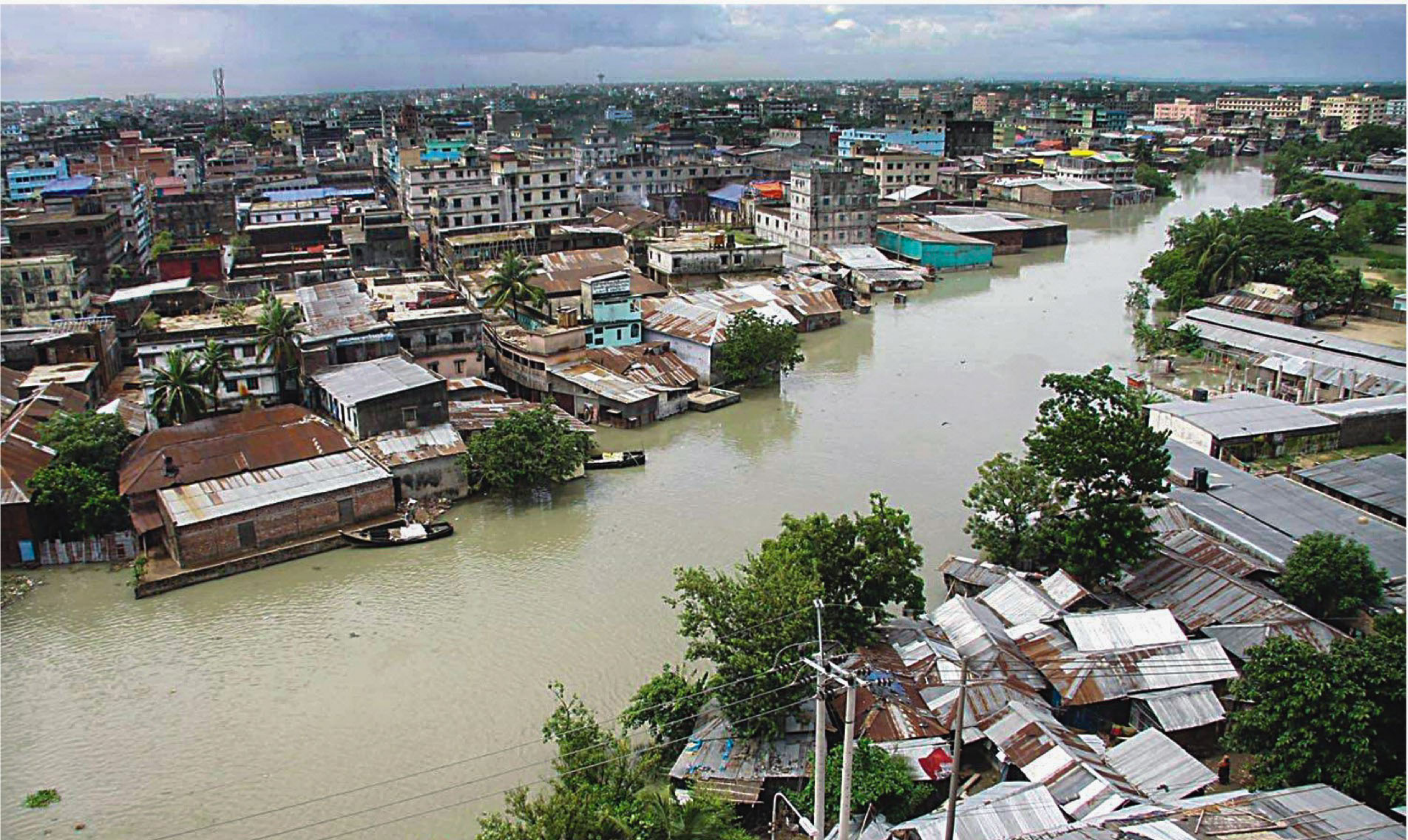
The Rajakhal Khal (canal) flowing beside Chaktai and Khatunganj was once the lifeline to business since loading and unloading of goods were done from the canal. But, the canal has been narrowed due to encroachments on both the banks. The narrow canal now results in waterlogging at Chaktai and Khatunganj during heavy rain and high tide, causing damage to huge properties.