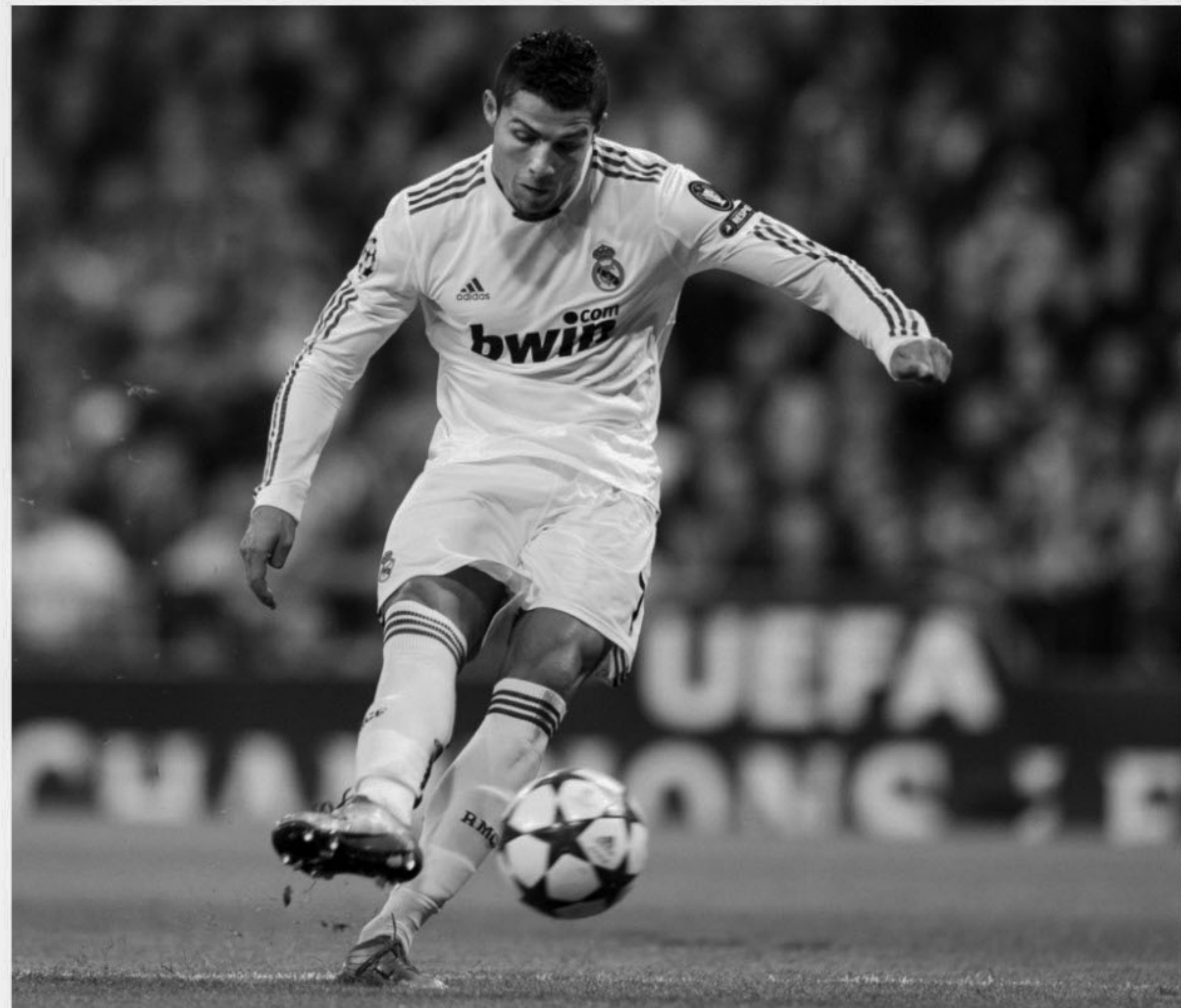
Real Madrid superstar Cristiano Ronaldo shoots to score the opening goal against AC Milan during their Champions League encounter at Santiago Bernabeu on Tuesday.

Roma (ITA) 1 (Borriello 21) Basel (SUI) 3 (Frei 12, Inkoomb 44, Cabral 90+3) Bayern Munich (GER) 3 (Cadu 32-og, Panin 37-og, Gomez 77) CFR Cluj (ROM) 2 (Cadu 28, Cullio 86) Spartak Moscow (RUS) 0 Chelsea (ENG) 2 (Zhirkov 24, Anelka 43) Marseille (FRA) 1 (Diawara 48) MSK Zilina (SVK) 0 Ajax (NED) 2 (de Zeeuw 7, Suarez 41) Auxerre (FRA) 1 (Birsas 56) Real Madrid (ESP) 2 (Ronaldo 13, Ozil 14) AC Milan (ITA) 0 Sporting Braga (POR) 2 (Lima 35, Matheus 90) Partizan Belgrade (SRB) 0 Arsenal (ENG) 5 (Song 19, Nasri 42, Fabregas 60-pen, Wilshere 66, Chamakh 69) Shakhtar Donetsk (UKR)