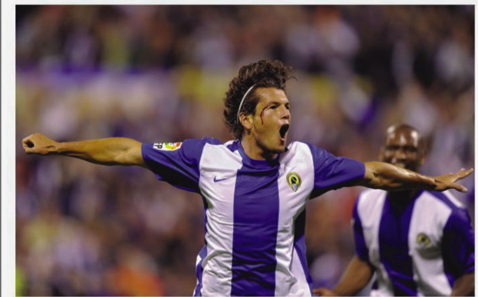
Hercules striker Nelson Valdez is ecstatic after scoring the opening goal against Villarreal during their Primera Liga clash at the Rico Perez Stadium on Monday.

Valero, though, went from hero to villain in the 80th minute as he received a straight red card for a dreadful tackle on Drenthe, and he was followed to the showers by team-mate Argentinian defender Mateo Musacchio three minutes later.