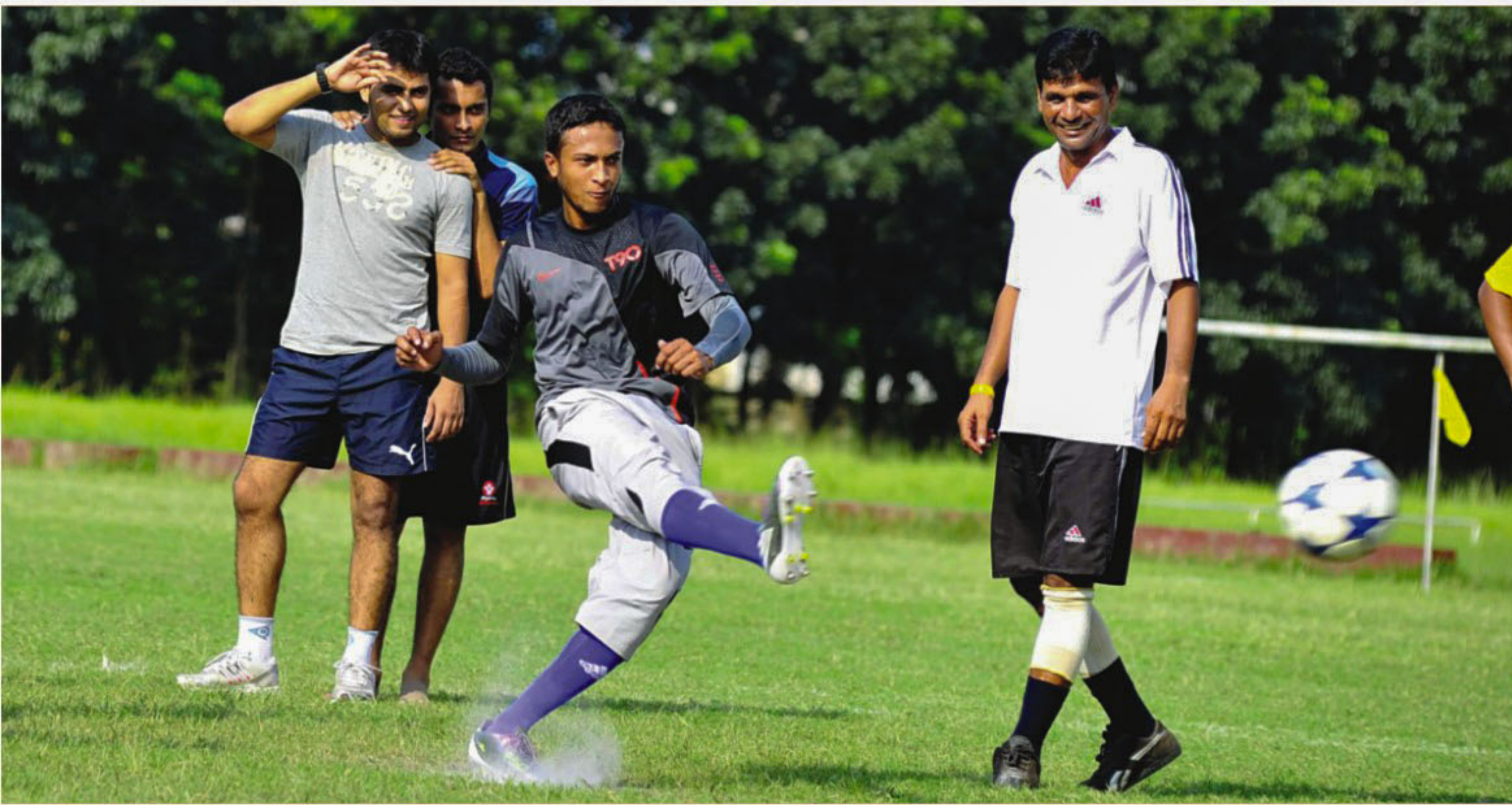
FOOTBALL IS MY PASSION: Bangladesh cricket captain Shakib Al Hasan (C) lets loose a fierce shot while playing a game of football with the students of BKSP in Savar yesterday. Shakib, who led the Tigers from the front to complete a 4-0 whitewash of New Zealand on Sunday, made a surprise visit to the country's lone sports institute where he learned his trade.