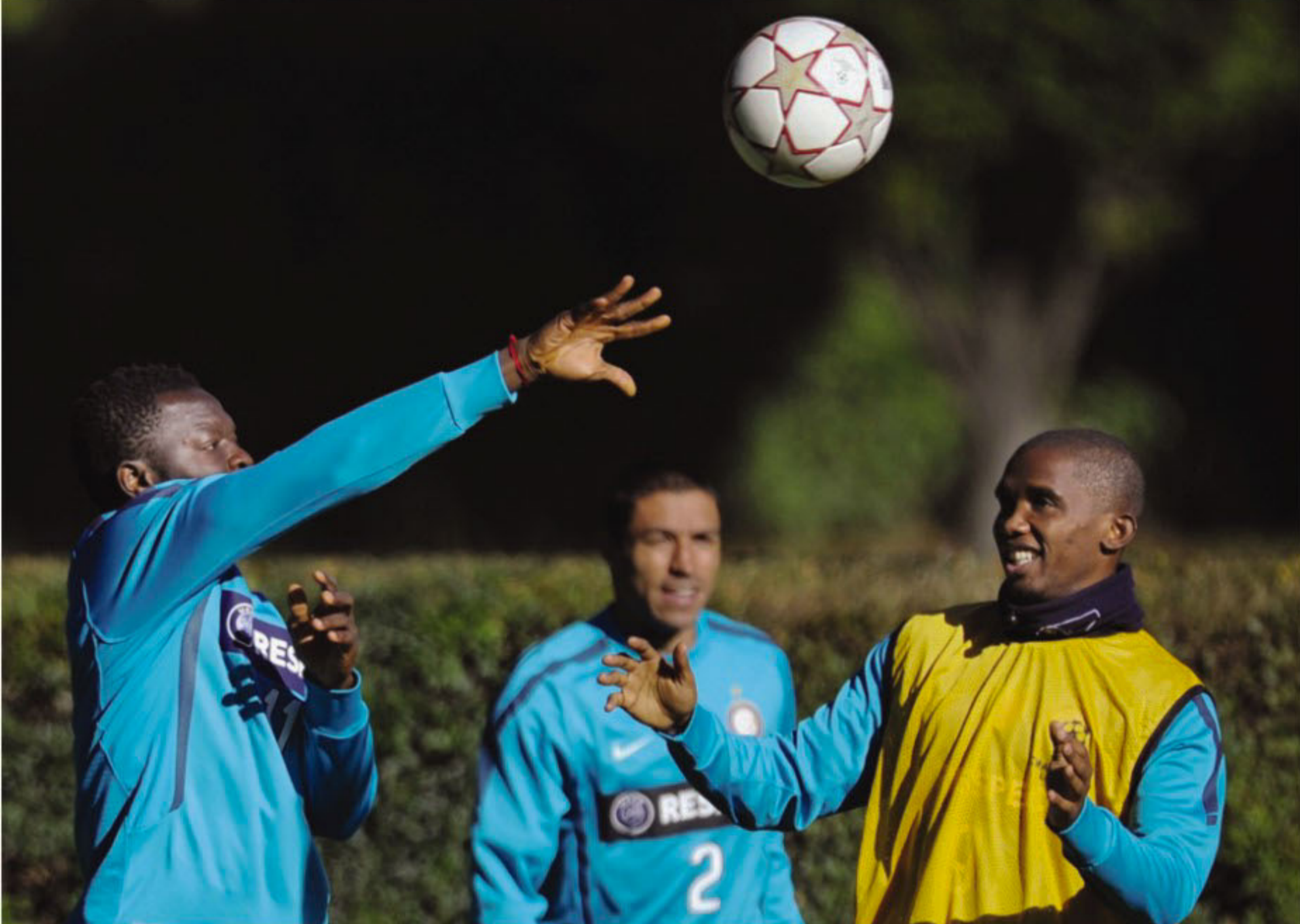
Inter Milan striker Samuel Eto'o (R) and midfielder Sulley Muntari (L) play with the ball during a training session in Appiano Gentile yesterday on the eve of their Champions League encounter against Tottenham Hotspurs.