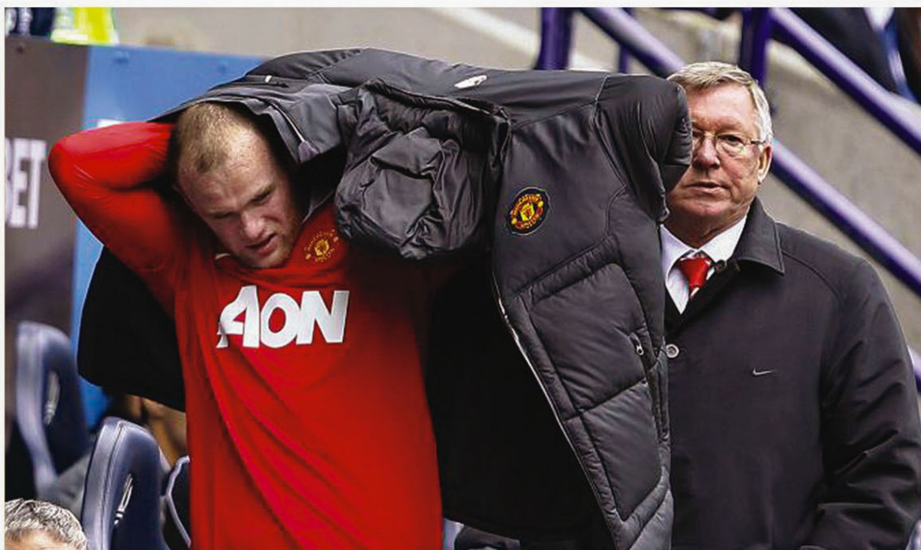
SO, YOU ARE LEAVING --- Manchester United coach Sir Alex Ferguson (L) yesterday confirmed that his star striker Wayne Rooney (R) was against renewing his contract with the Reds, opening the window of probably the most expensive transfer sooner than later.