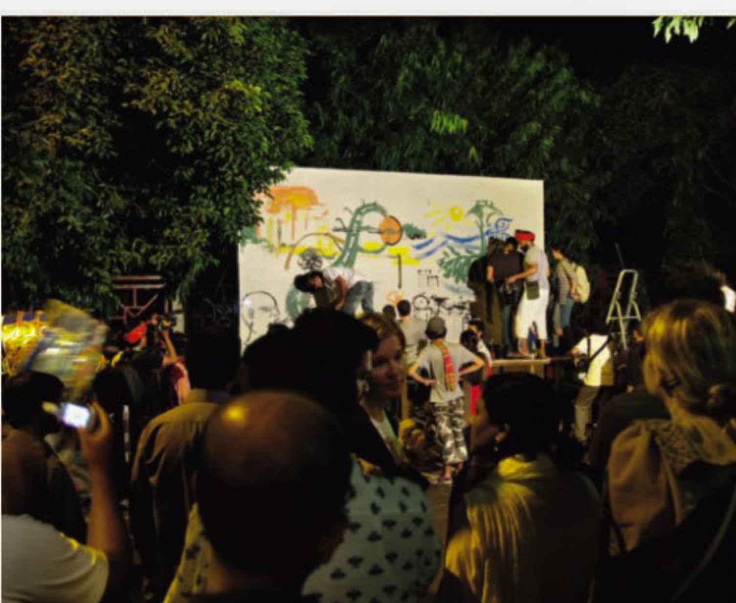
Interactive painting drew art enthusiasts at the event.