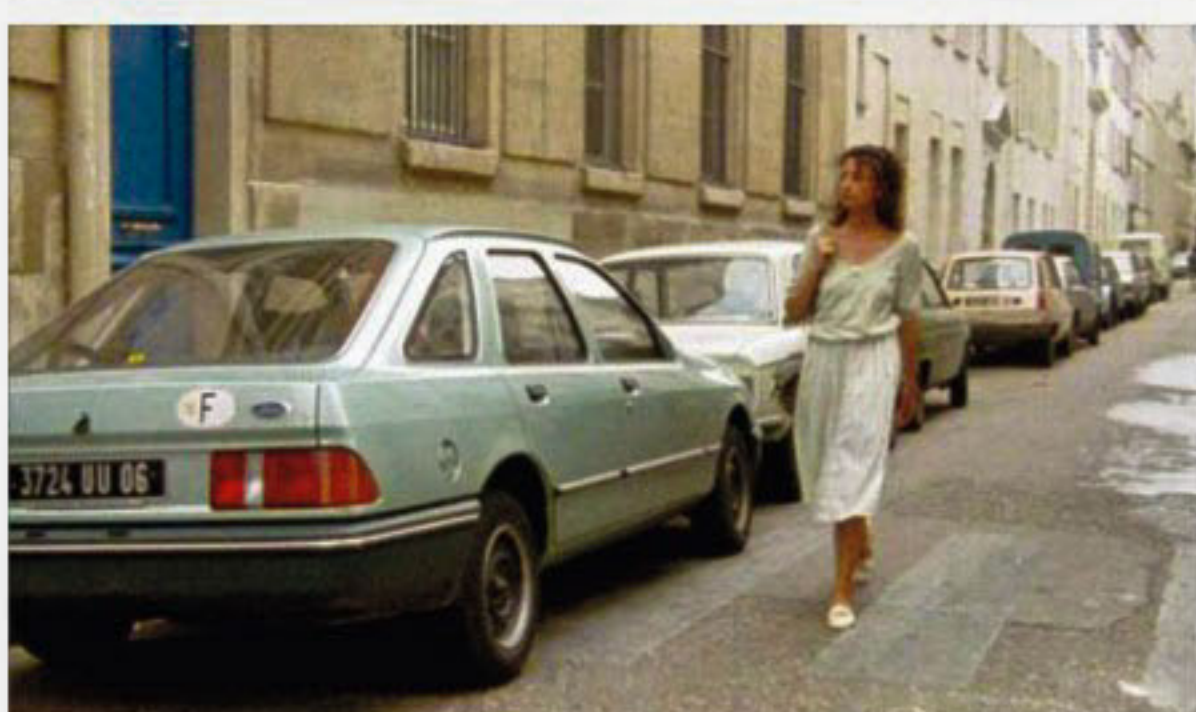
A scene from "The Green Ray", one of the films to be screened at the retrospective.