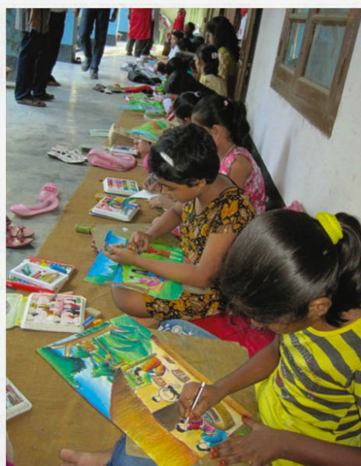
Youngsters take part in the competition.

In the concluding session, the chief guest distributed prizes among the winners of the painting competition.