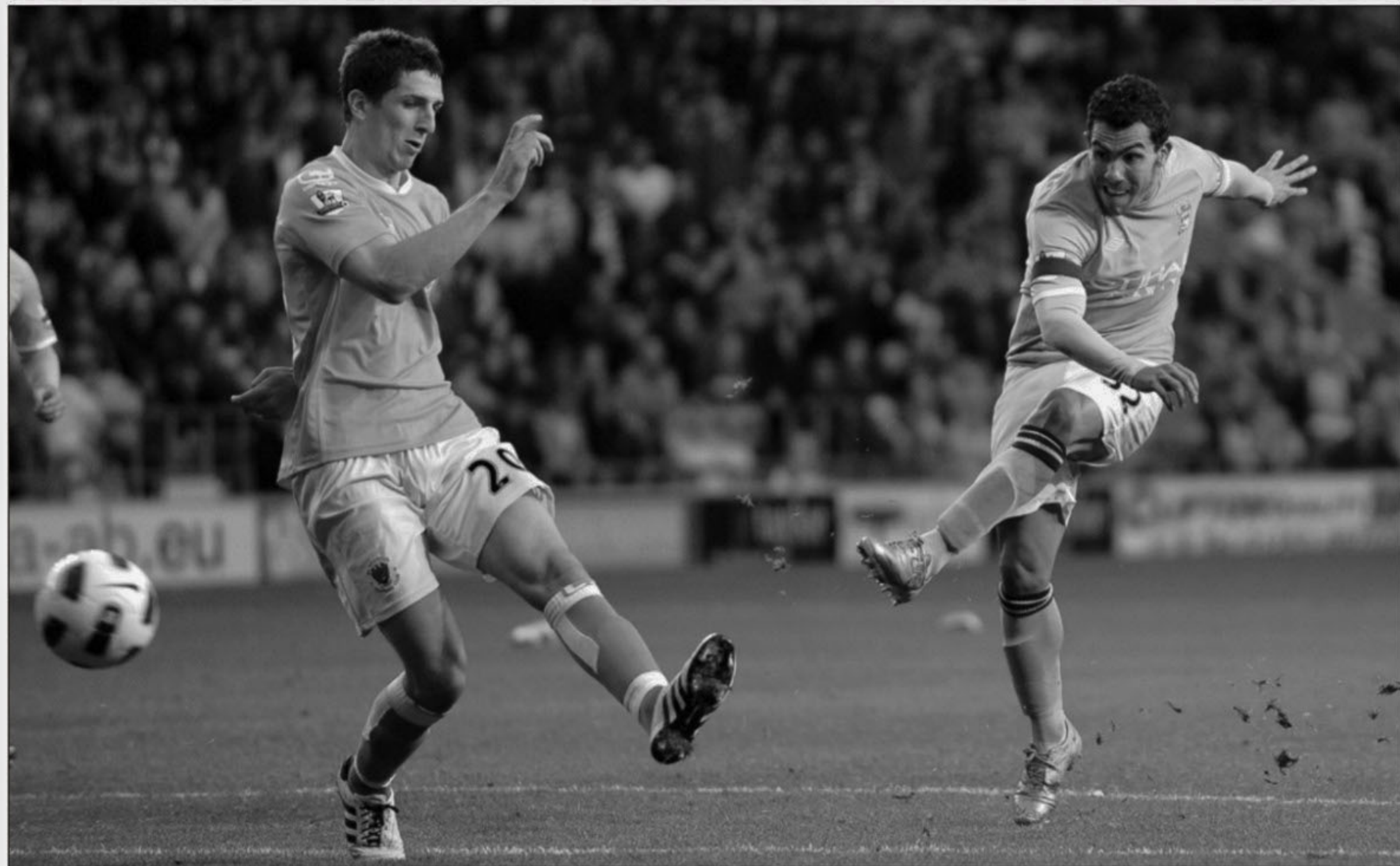
CANT STOP SCORING: Manchester City striker Carlos Tevez (R) scores his second goal against Blackpool during their Premier League encounter at Bloomfield Road on Sunday.

Spanish international Silva netted a sublime third for City on 90 minutes before Taylor-Fletcher hit back for Blackpool to ensure a nerve-wracking final minute of stoppage time for Roberto Mancini's men.