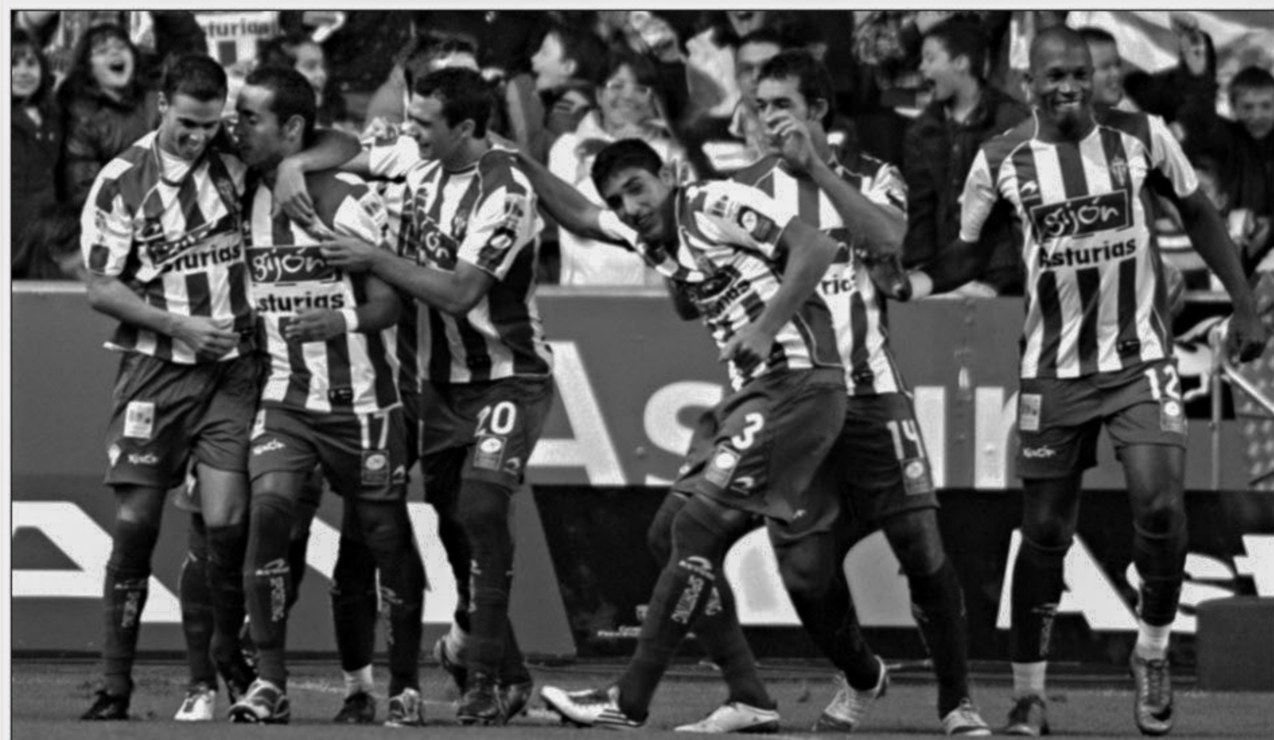
Sporting Gijon players celebrate their second goal against Sevilla during their Primera Liga clash at the Molinon Stadium on Sunday.

Levante scored twice in six minutes with former Chelsea man Asier del Horno opening the scoring after 59 minutes before Ecuadorian striker Felipe Caicedo, on loan from Manchester City, struck on 65 minutes.