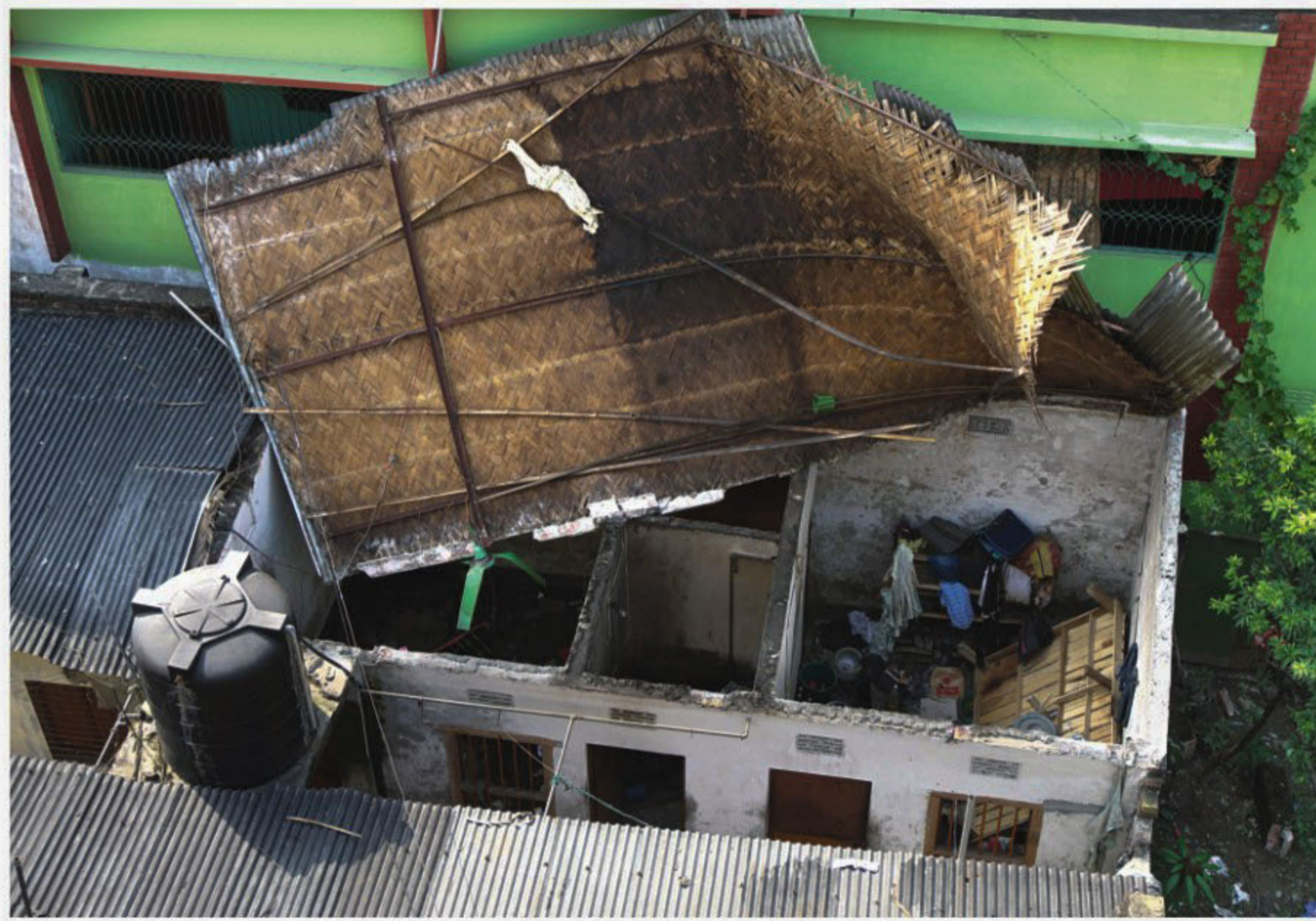
The tin-shed house in Fatullah, Narayanganj after an explosion there yesterday that injured six people.

Contacted, Education Minister Nurul Islam Nahid expressed the hope that the project would have a positive impact on the overall standard of education.