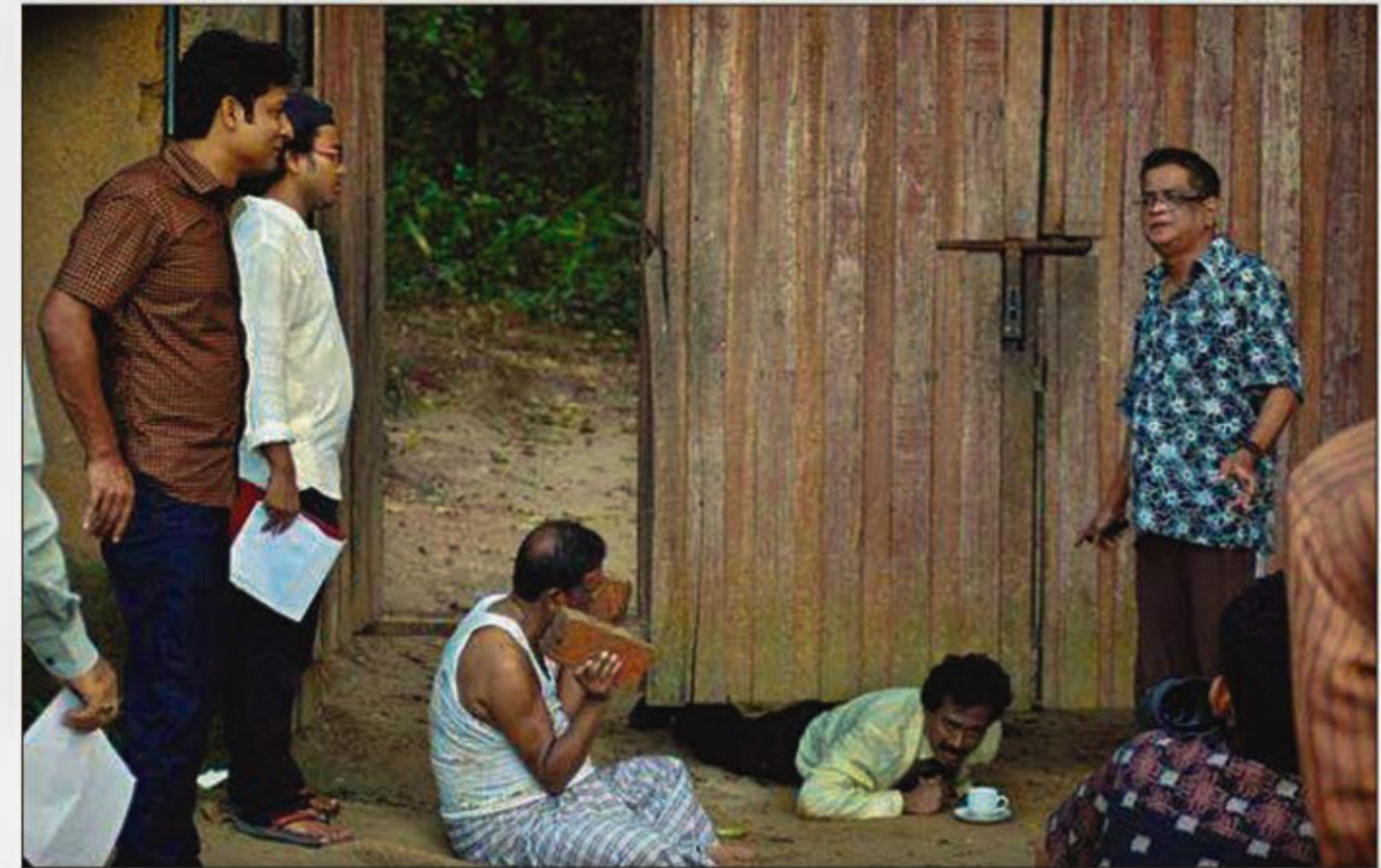
Humayun Ahmed (R) directs a rib-tickling comedy.

Meanwhile the director is planning to resume work on "Jochhna o Jononir Golpo" soon, having abandoned the project after only three episodes, in protest of the demolition of Lalon's statue in front of the airport. Humayun said he will begin work on the drama as soon as shooting for his latest movie "Ghetu Putro Komola" is done. After two rounds of delays the film's shooting resumes on October 25 at Nuhash Palli, Sunamganj and Brahmanbaria.