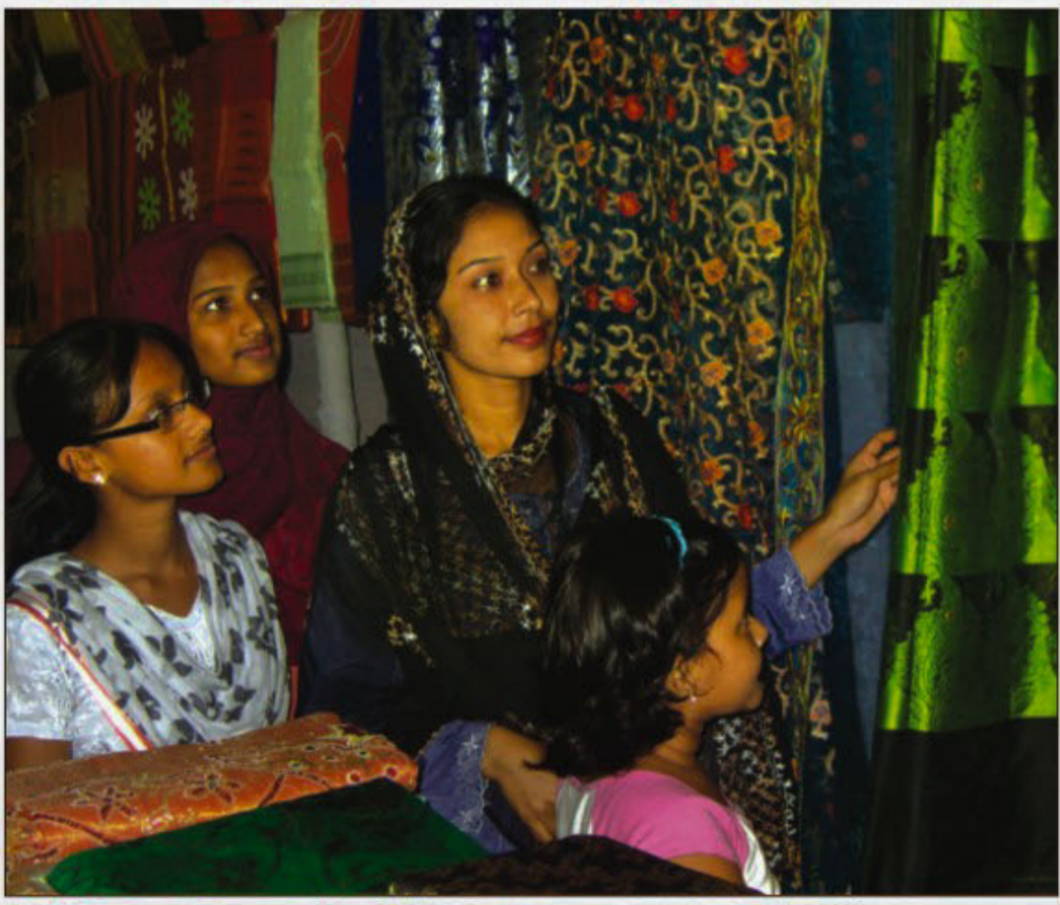
The opening day witnessed a rush of visitors.

Saris with various designs and colours like banarasi silk, buti banarasi, katan, phulkali, kanjivarom,