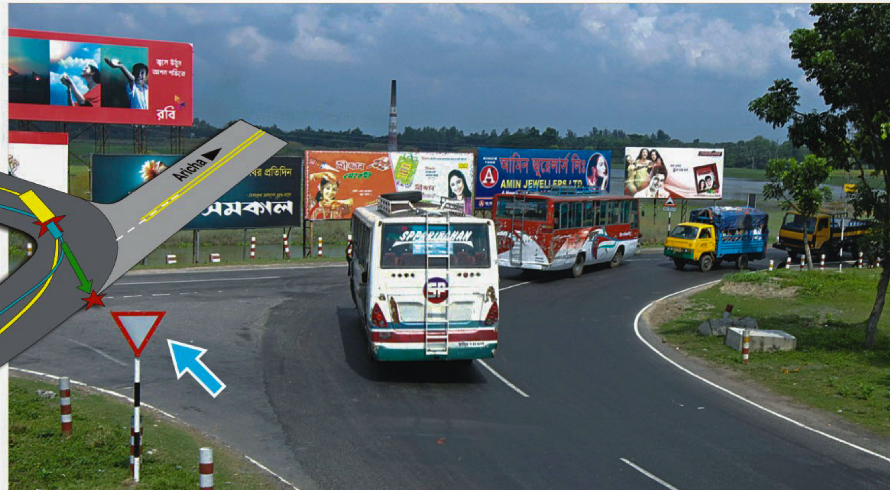
The road sign (pointed by a blue arrow) at this T-junction on Dhaka-Aricha-Paturia highway in Manikganj is wrong. There should be a "T" sign inside the triangle to alert the drivers of approaching vehicles from the right and left.