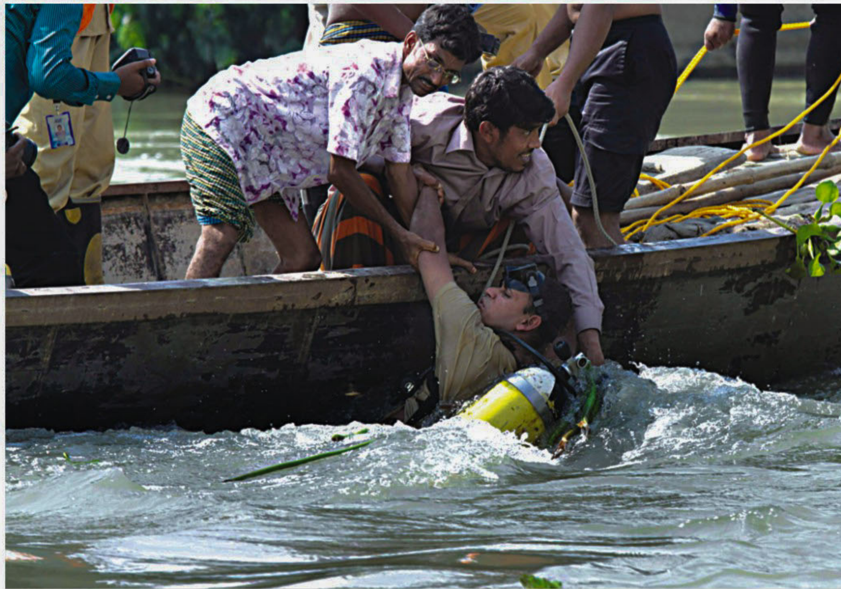
Divers on a rescue operation in the River Turag near Salehpur Bridge of Amin Bazar in Savar on October 10 after a city bus plunged into the river.