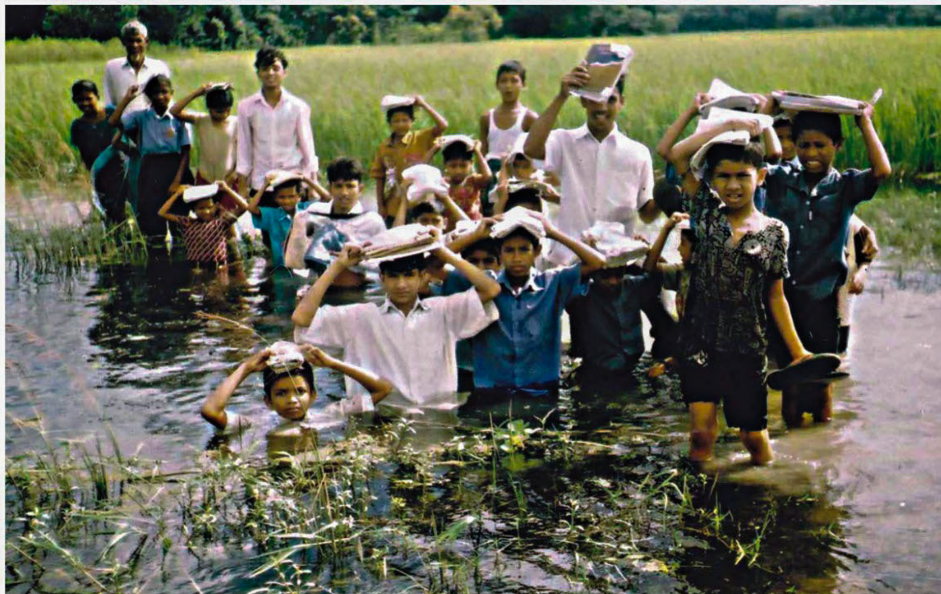
This is how the students of Hundir Beel in Chandpur sadar upazila go to school during the rainy season.