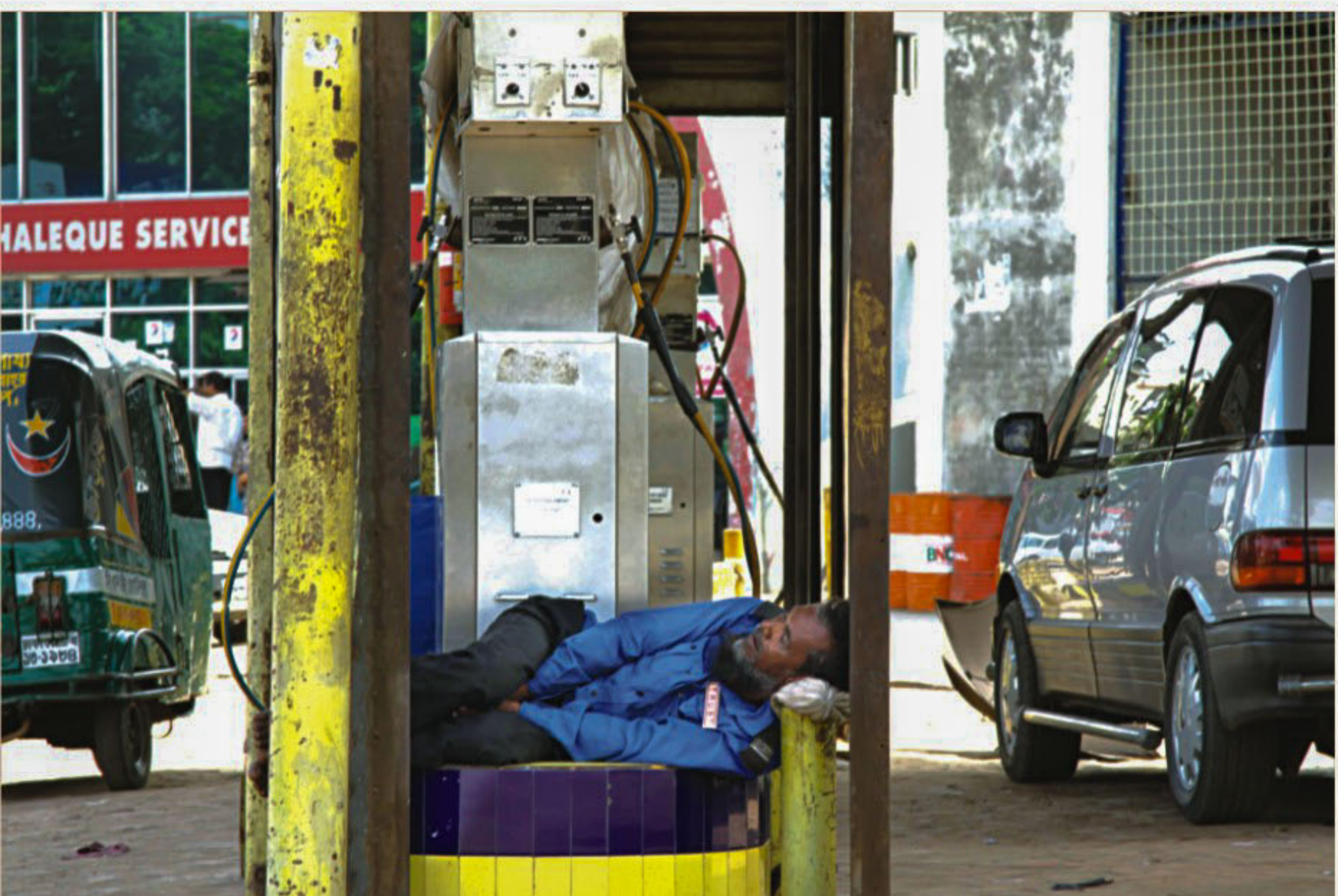
This CNG filling station on Mirpur Road in the capital lies idle for lack of gas supply. The security guard takes a nap, while vehicles come only to leave the station without any service. The photo was taken at 1:30pm yesterday.