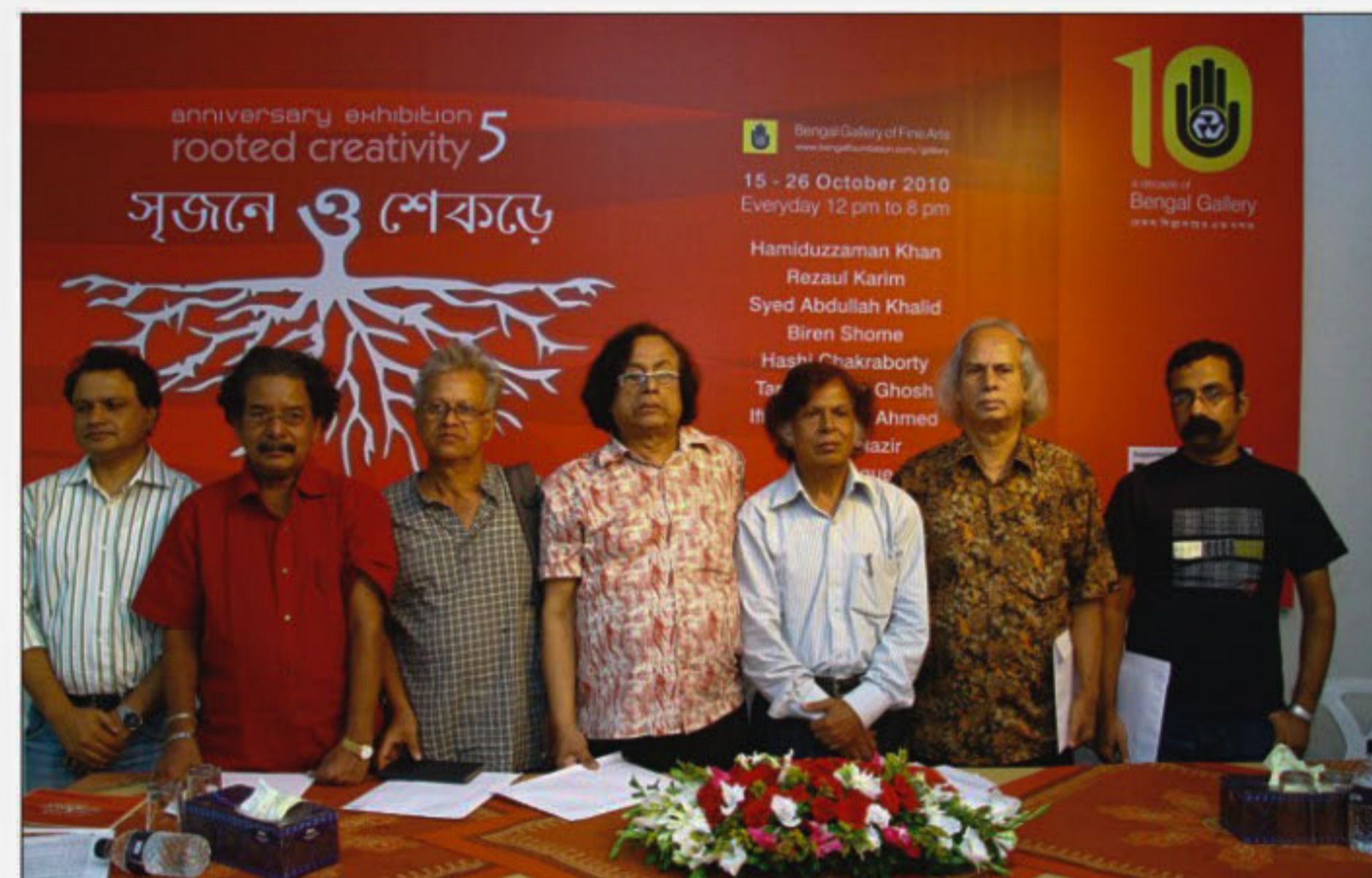
The participating painters at the press conference at Bengal Café.