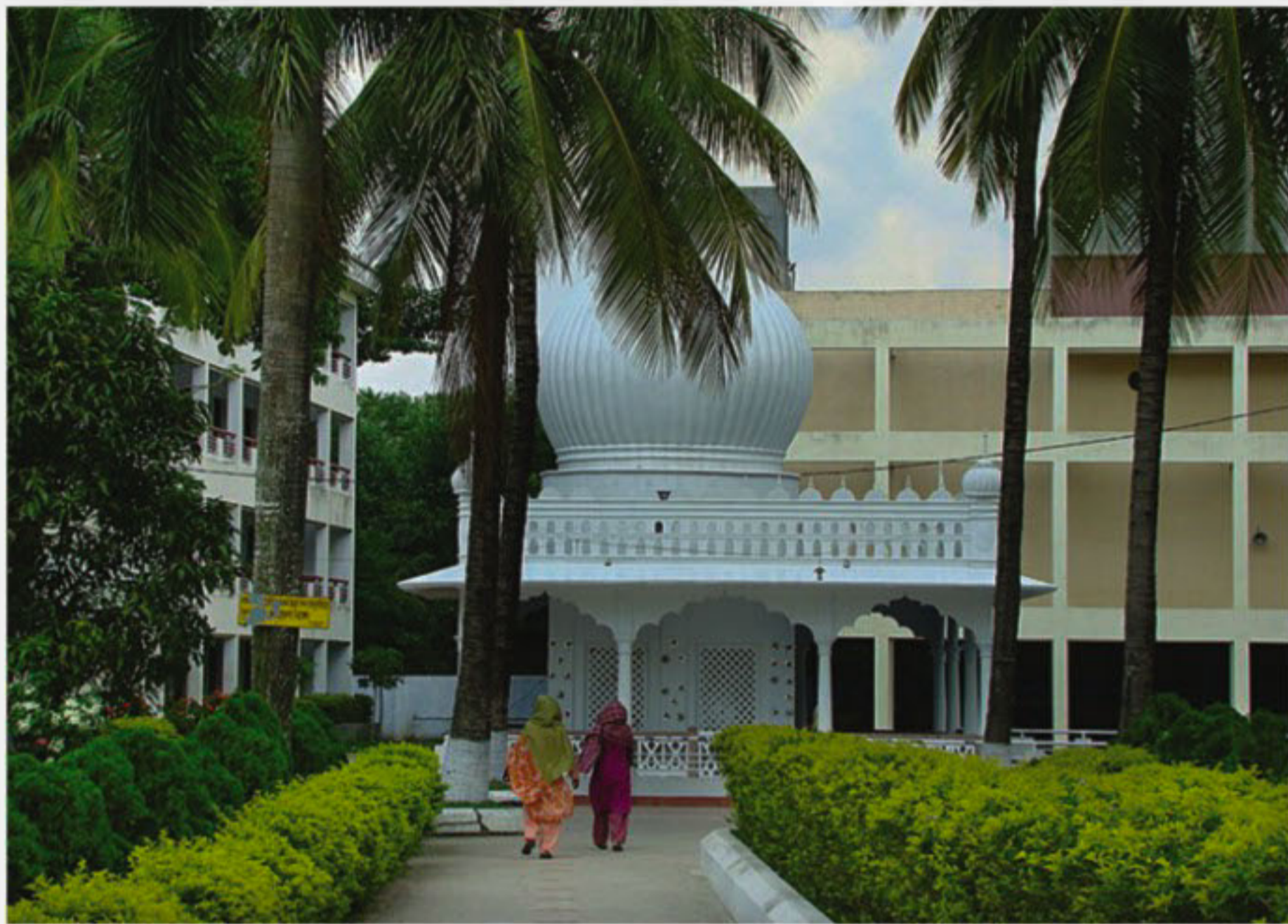
Lalon's shrine at Chheuria, the venue of the present-day Lalon Mela.