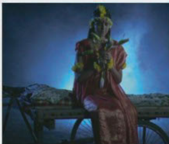
Jibon Gari On Desh TV at 11:55 pm Single Episode TV Play Cast: Tanzika, Sajol, Tisha