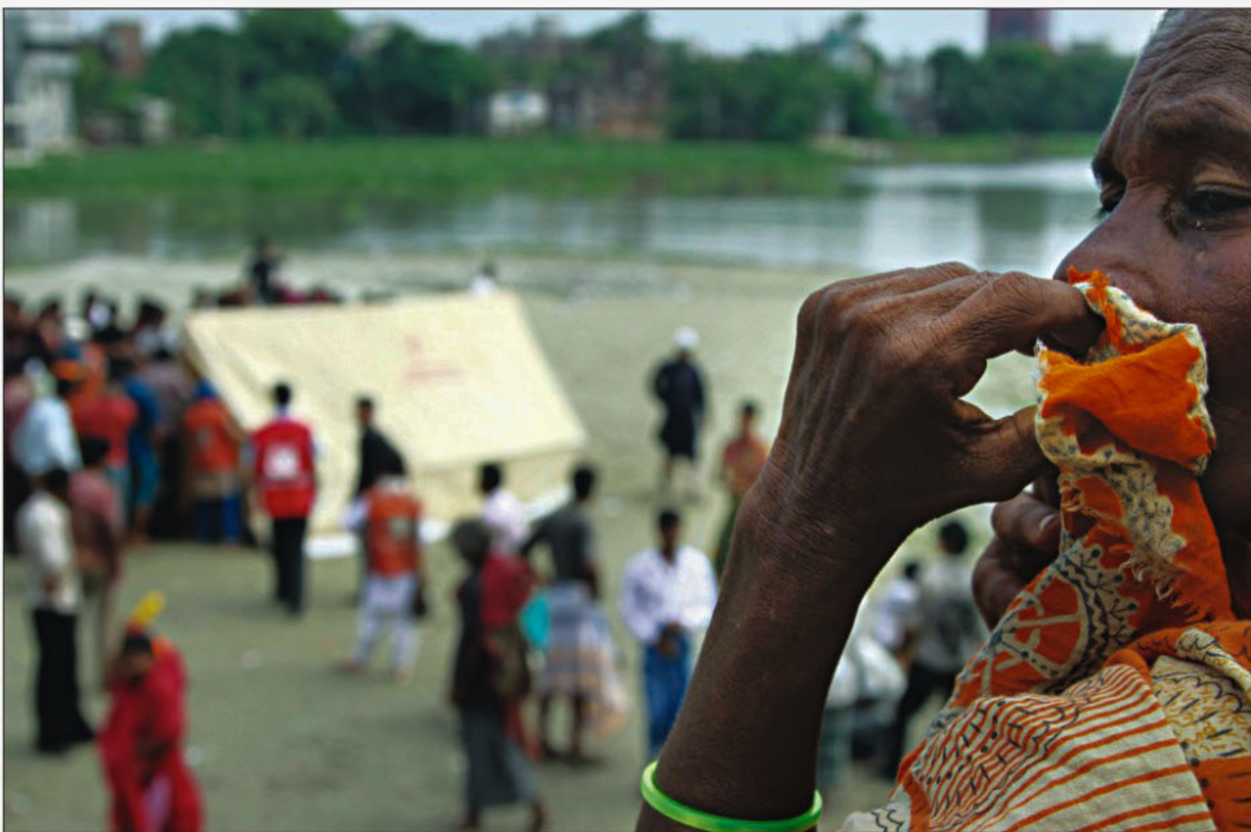
An elderly woman covers up her nose to resist stink coming out of the decomposed bodies of victims who died in the tragic bus accident on Sunday near Ameen Bazar, outskirts of the city.

Friends and relatives are requested to join the occasion and pray for salvation of the departed soul.