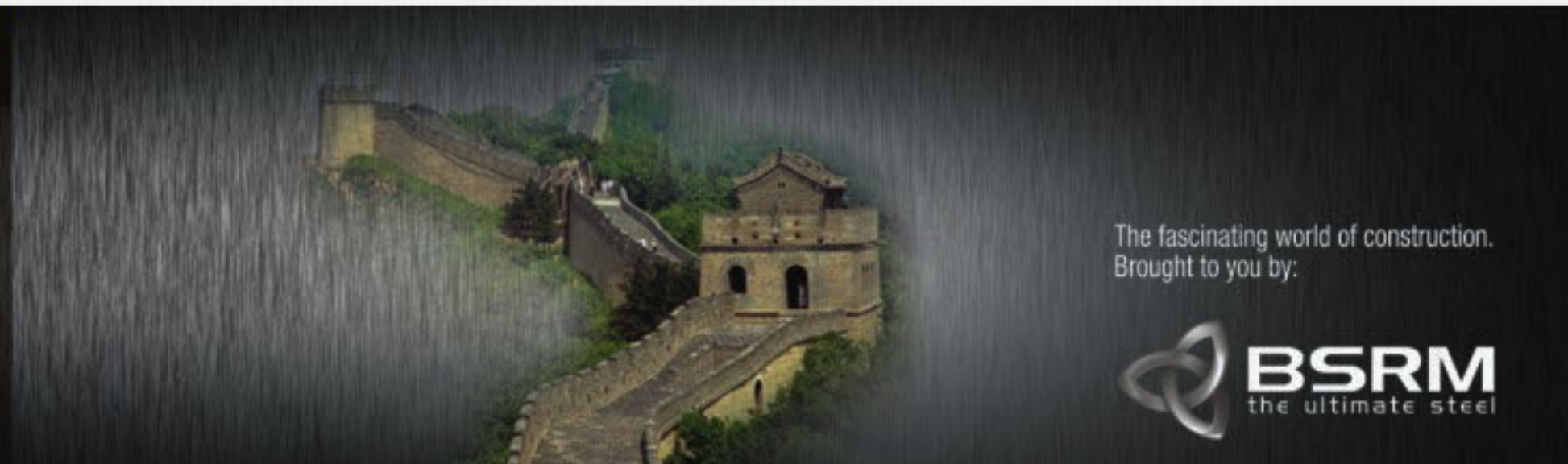
The fascinating world of construction. Brought to you by:

The Great Wall of China is the longest man-made structure in the world, with a length of over 6,352 km. (3,948 miles).