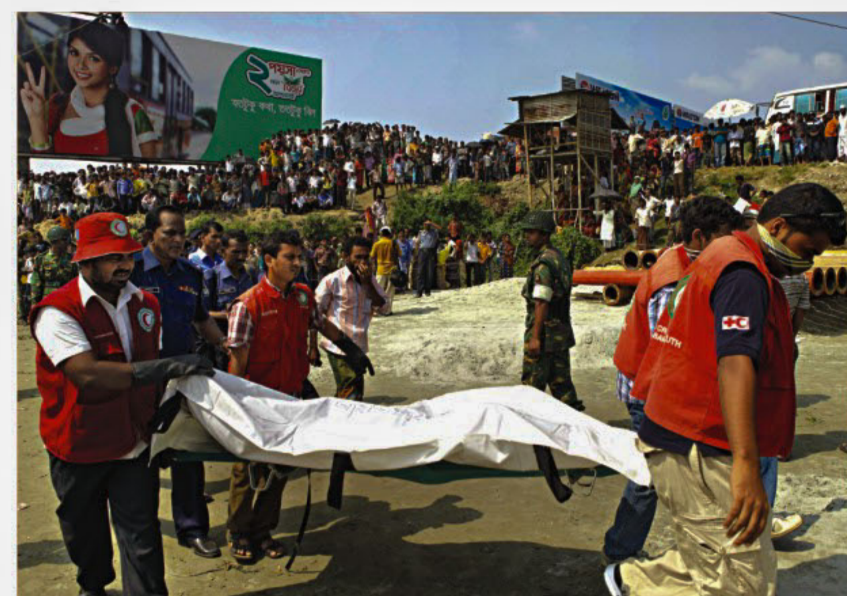
People see rescuers salvaging the sunken bus yesterday, but tears did not cease to shed from the eyes of near and dear ones of the victims. As yet, 11 bodies have been recovered with the rest of some 50 people still missing. (Story on Page 1)