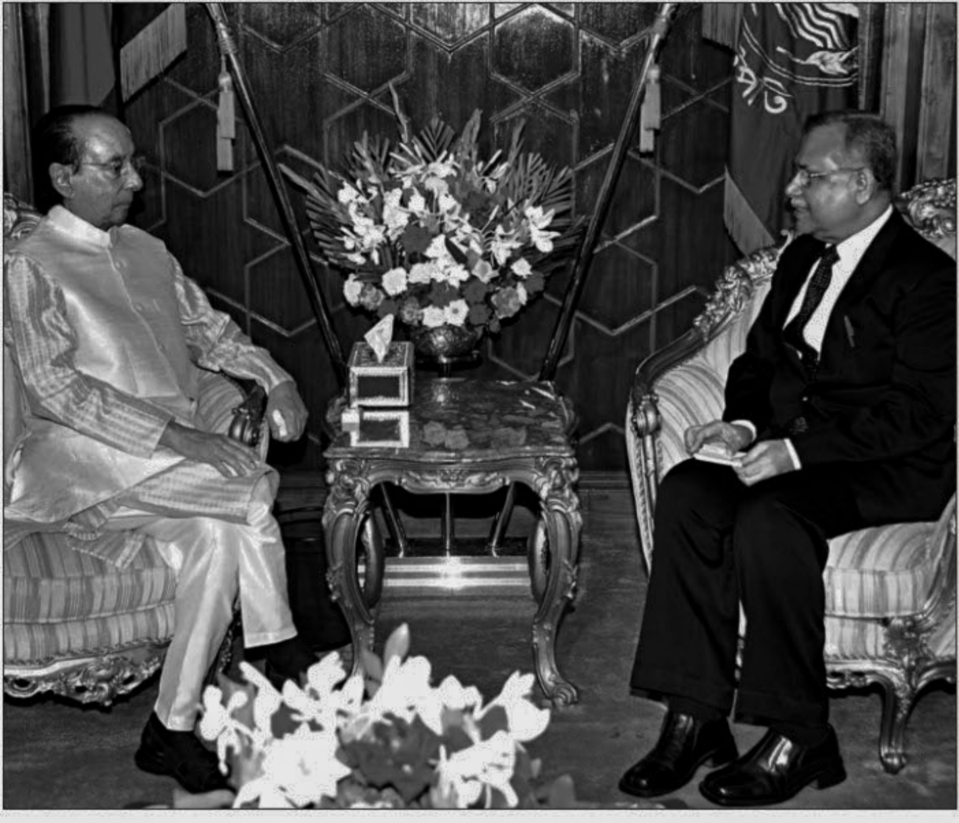
New Chief Justice ABM Khairul Haque calls on President Zillur Rahman at Bangabhaban in the city yesterday.

The PM urged the opposition leader not to take any revenge on the people. "You had failed to serve the nation and its people, that's why the people did not cast their votes for you. Don't be angry with the people, and stop taking revenge on them. Let us do our duty for the people," Hasina advised her political rival.