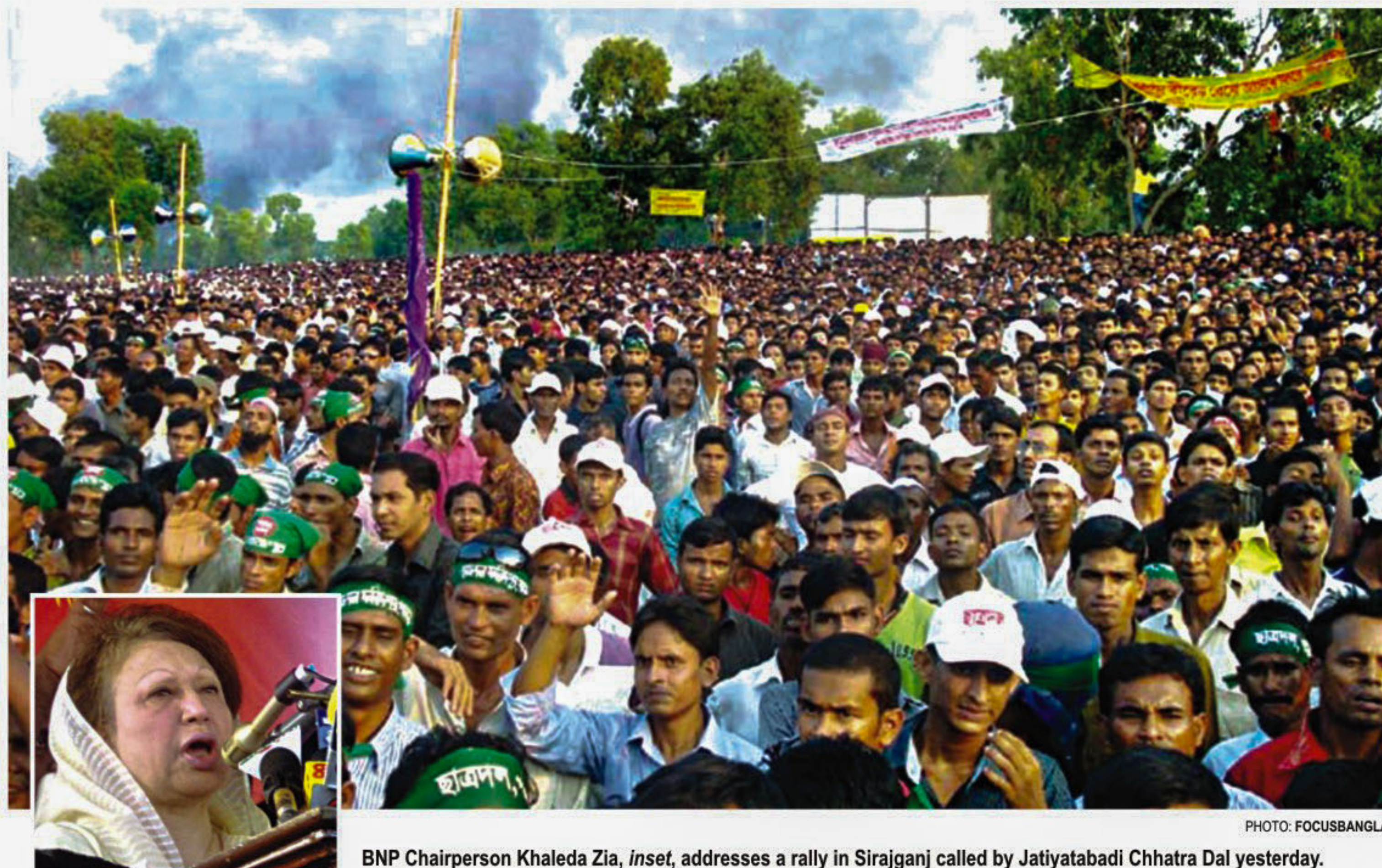
BNP Chairperson Khaleda Zia, inset, addresses a rally in Sirajganj called by Jatiyatabadi Chhatra Dal yesterday.