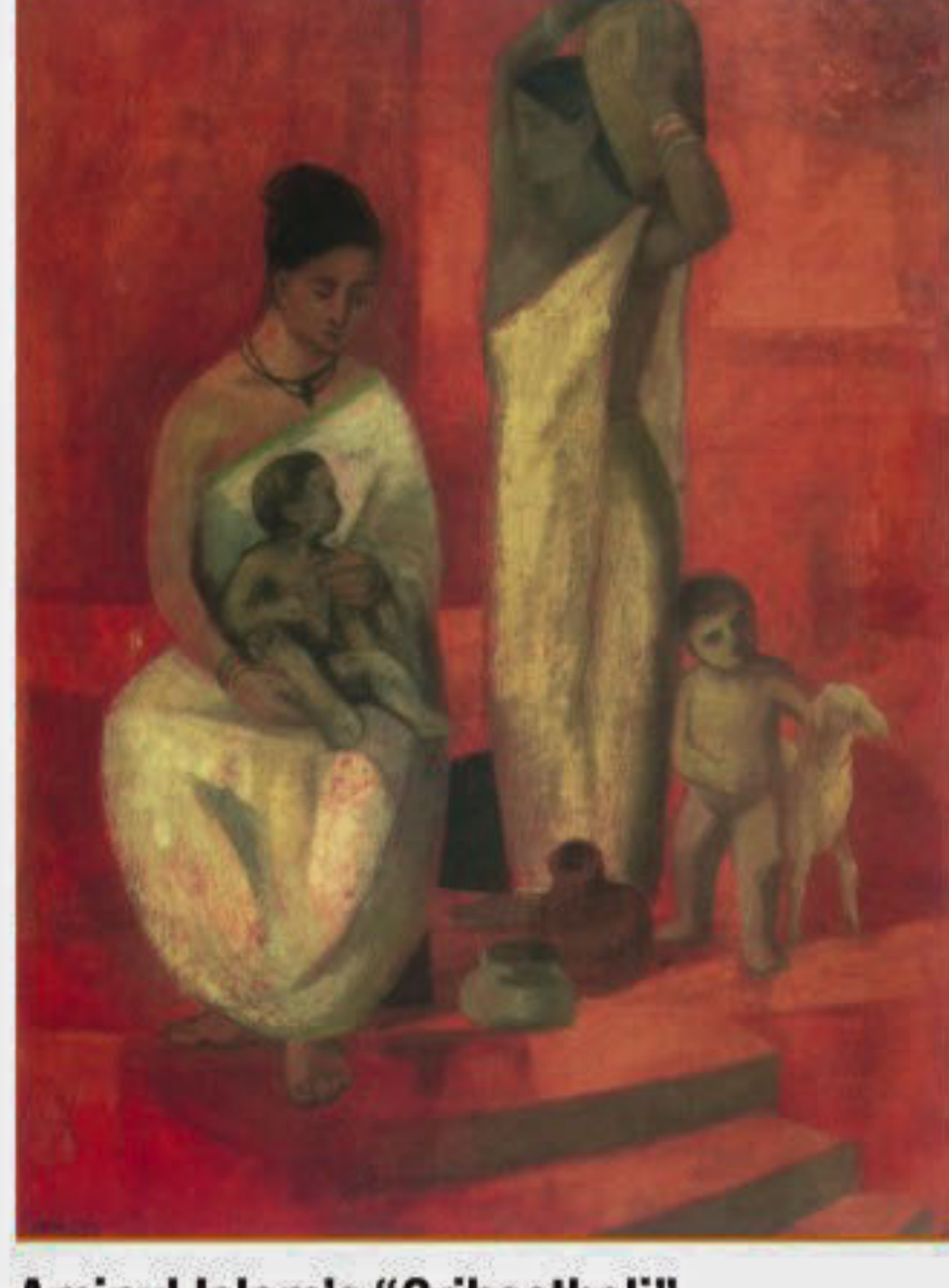
Aminul Islam's "Grihasthali"