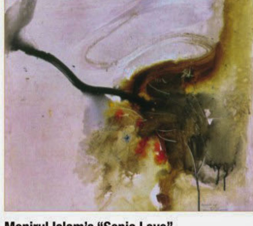
Monirul Islam's "Sepia Love"