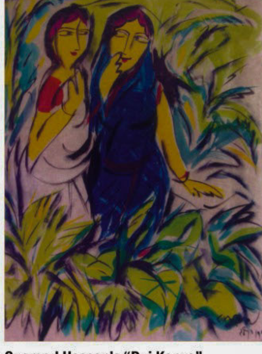
Quamrul Hassan's "Dui Konya"