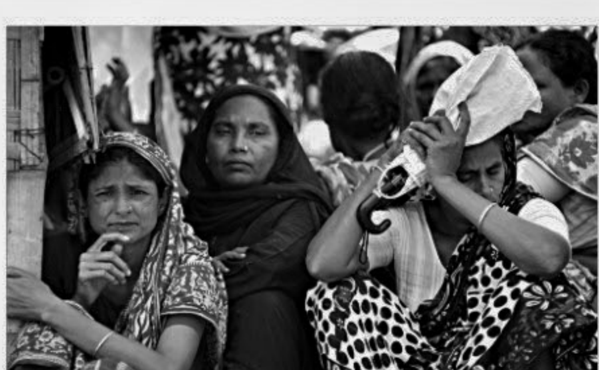
A crowd of people on the bridge near Amin bazar are watching the rescue operation for the Savar-bound bus, which fell into the River Turag with about 50 passengers on Sunday. The Dhaka-Aricha Highway was barricaded. Most of the passengers remained missing till yesterday noon though the salvage work was carried out overnight. The family members and relatives awaiting for the victims with deep concern. (Story on Page 16)