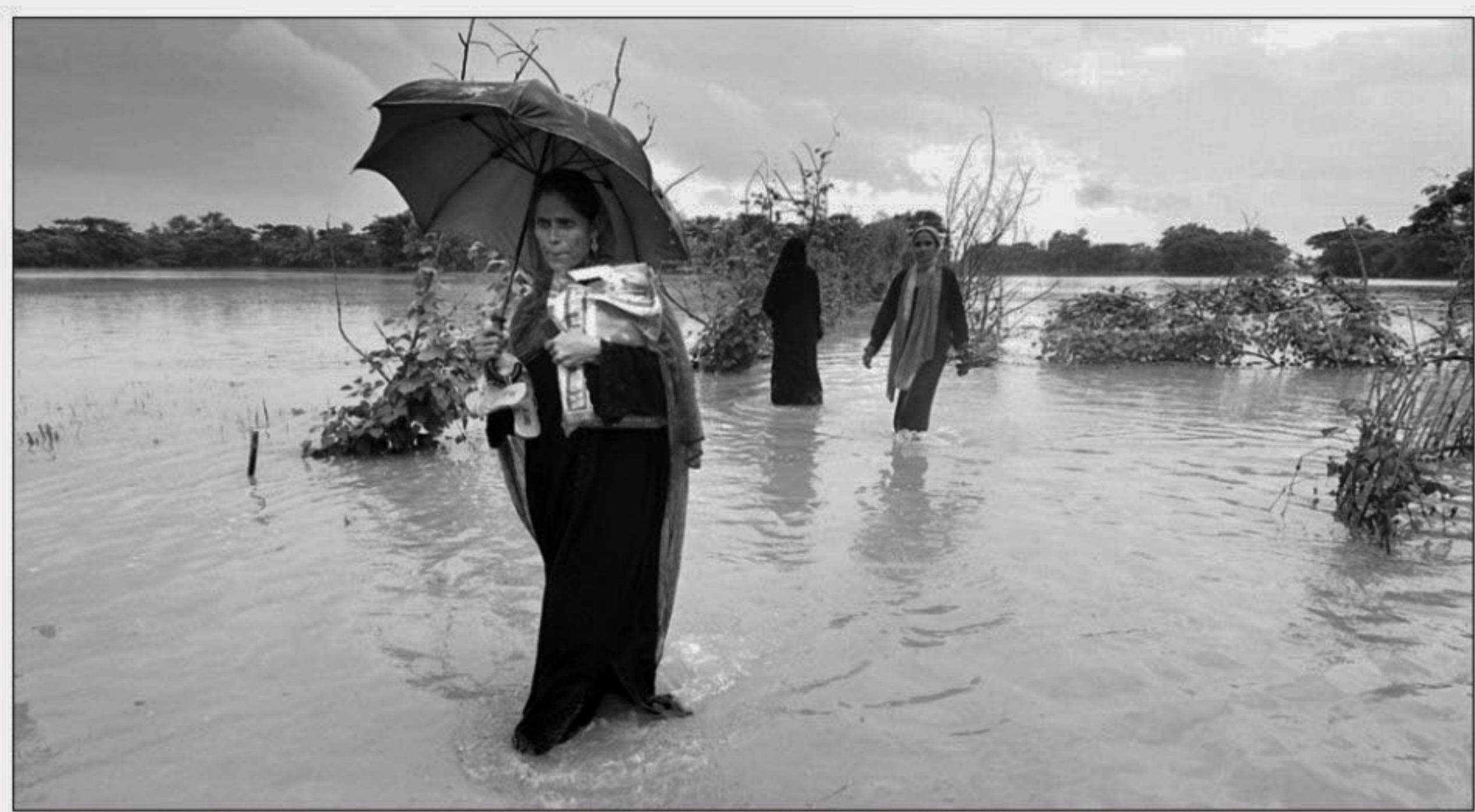
Women wade through a flooded path in Juidandi union of Anowara upazila under Chittagong district yesterday as a large area of the upazila remains submerged following higher than usual tidal surge on Friday due to the low over the Bay.

OUR CORRESPONDENT, Dinajpur Chararhat mass killing day observed in Nawabganj upazila of Dinajpur yesterday. On this day in 1971, Pakistani occupation army with the help of their local collaborators killed at least 103 people of two villages. Shefali Begum, an eyewitness to the incident, said the Pakistani army and their local collaborators came to the village at midnight. They entered the houses, picked up 103 people. They took the villagers to Chararhat and shot them dead. Md Abdul Kader, another witness, said at least 67 men and 36 women were killed by Pakistani army on that night. Villagers urged the government to build a memorial at Chararhat for the martyrs.