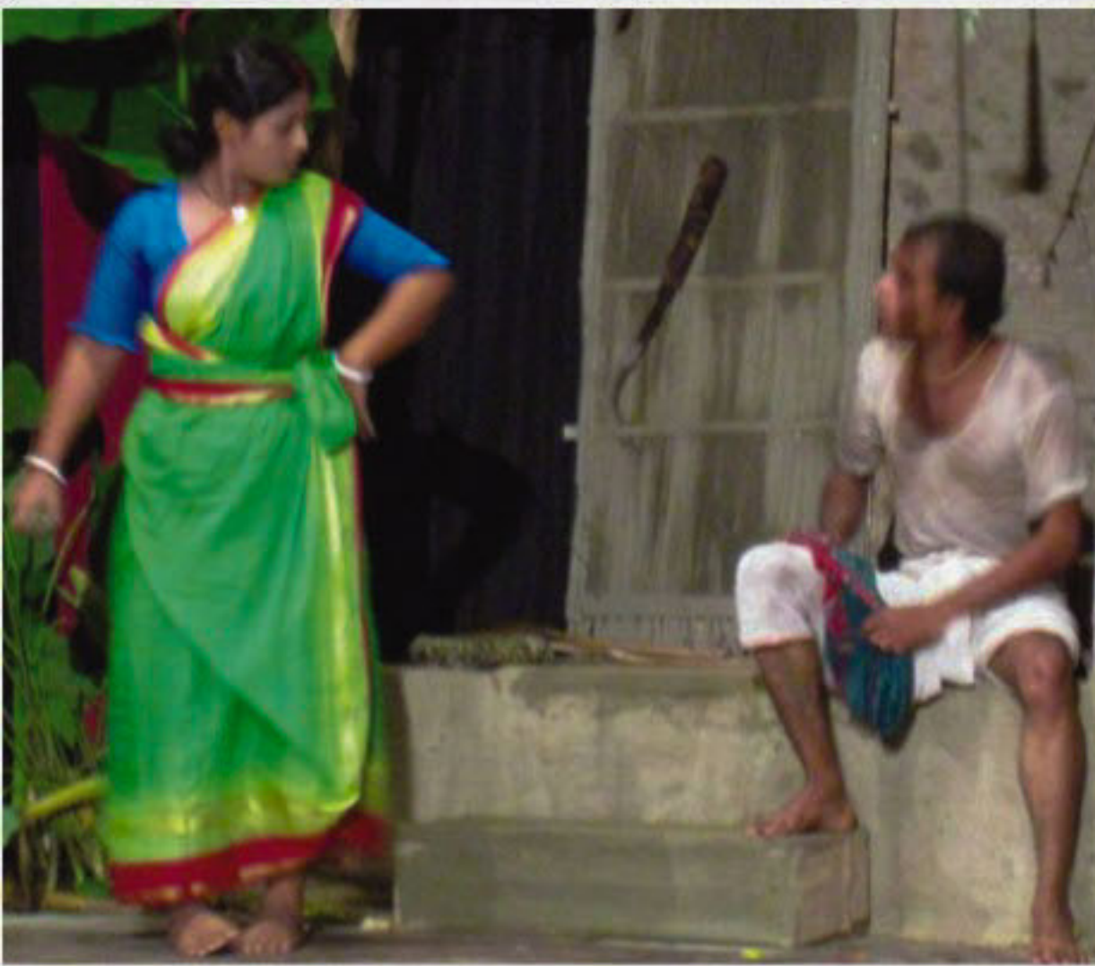
Mymensingh Udichi staged the play.