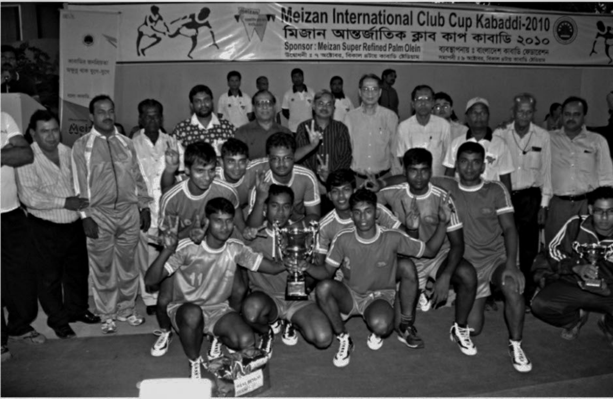
Players of West Bengal kabaddi team pose for photographs with the Mizan International Club Cup trophy at the Kabaddi Stadium yesterday. They won the title defeating Japan by 14-10 points in the final.