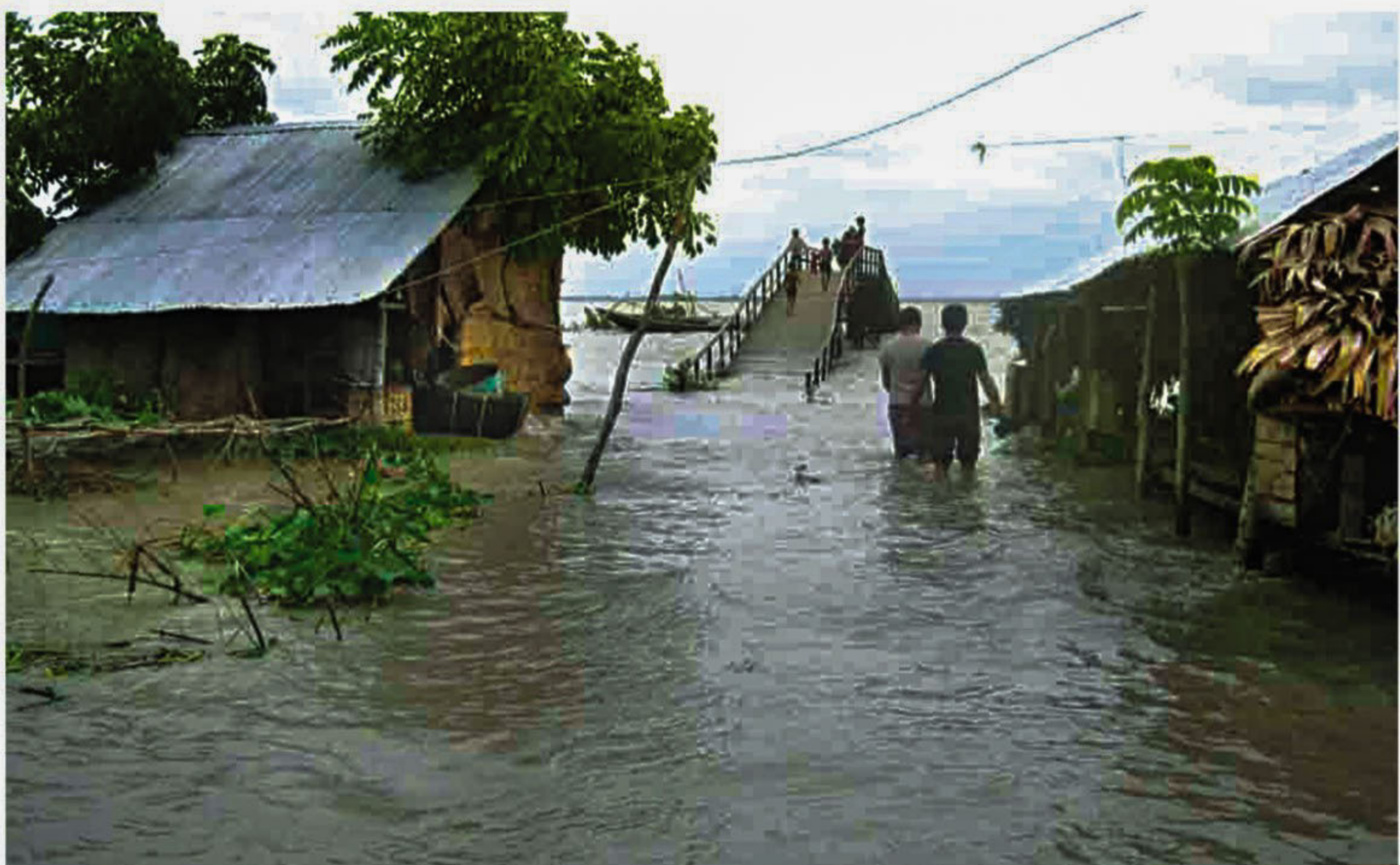
Thousands remain marooned in vast areas of coastal districts. People of Bashbaria village under Dasminar upazila of Patuakhali are seen leaving their submerged houses for shelter on a bridge. Met office says another low has formed in the north-west Bay.