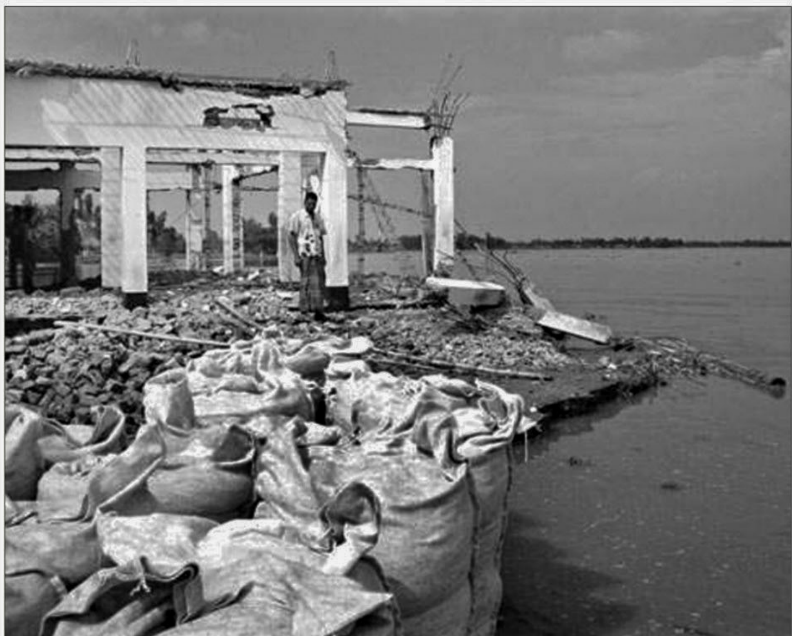
Workers dismantle the concrete structure of Singria Primary School in Phuleshwari upazila of Gaibandha district in a bid to remove whatever they can as the building is on the brink of being devoured by the Jamuna.

More than 800 delegates from 119 upazilas of 14 districts including Brahmanbaria, Feni, Chandpur, Laxmipur, Noakhali, Cox's Bazar, Bandarban and Khagrachhari Hill districts attended the conference.