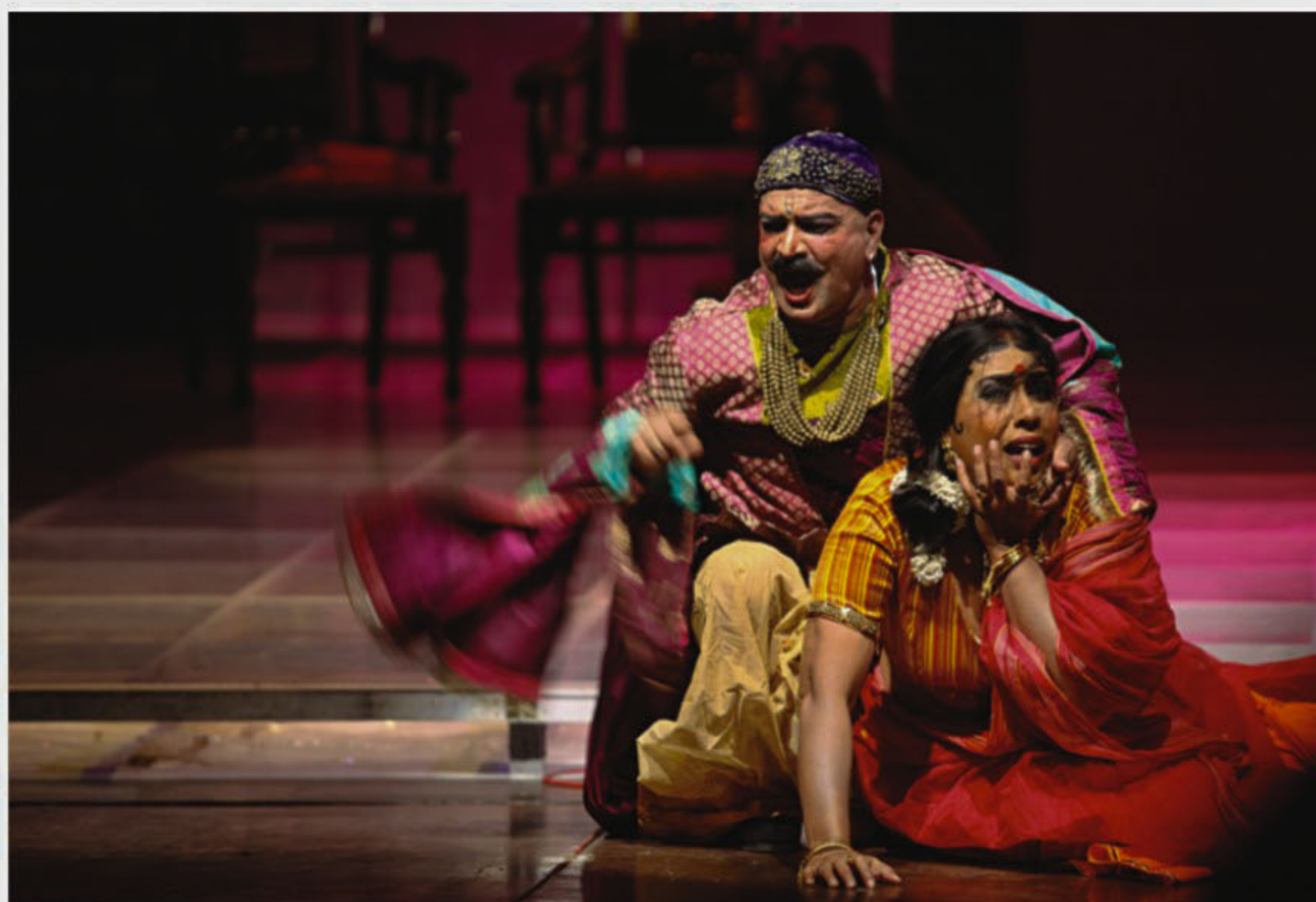
"Nati Binodini" uses a multi-layered approach where action shifts between the aged Binodini and four other actresses who depict her early days.