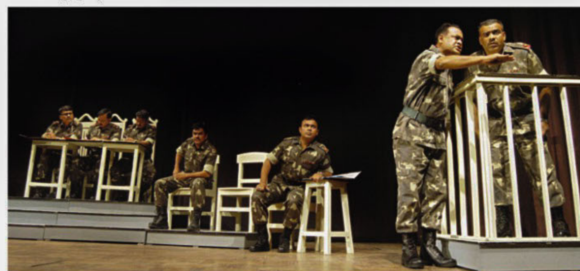
A scene from the play "Court Martial".

Shilpakala Academy production "Eksho Bosta Chaal". He has also directed plays for his troupe.