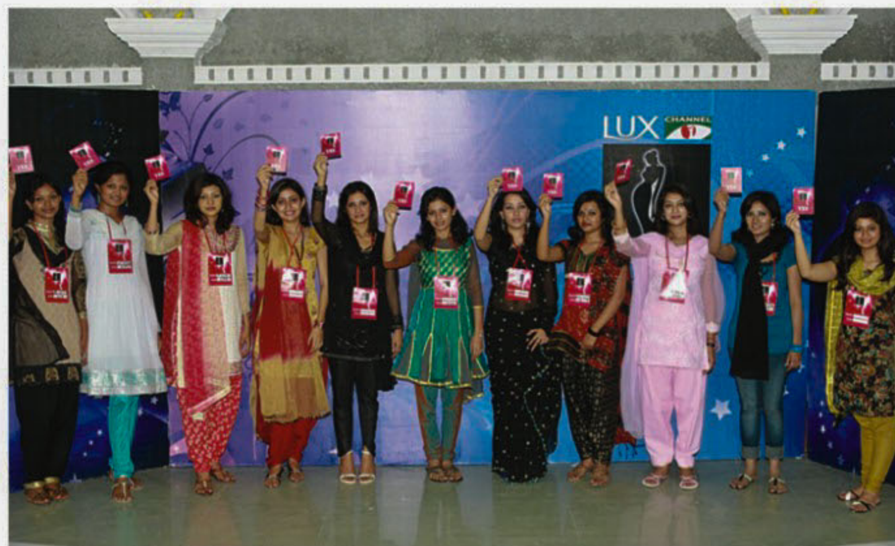
Candidates from different districts of Khulna and Barisal divisions took part in the daylong competition, which was held amidst festivity.

The winners will get the chance to participate in the final round of audition to be held at the national level in Dhaka.