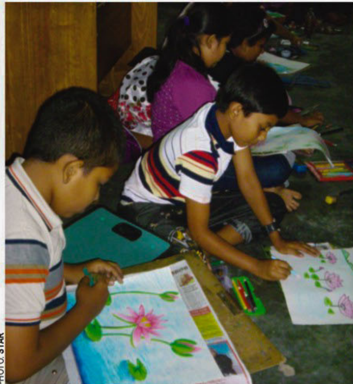
Students of several educational institutions took part in the competition.