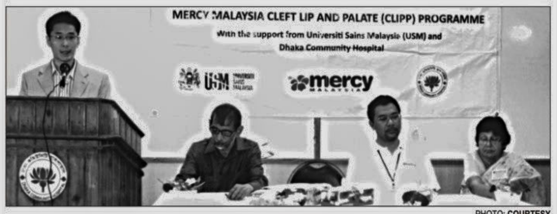
Dhaka Community Hospital in collaboration with MERCY Malaysia launches an October 8-15 plastic surgery programme of cleft lip and palate reconstruction at the hospital in the city.

His namaz-e-janaza will be held at Gulshan Azad Mosque in the city after Zohr prayers on October 11. He will be buried at Banani Graveyard.