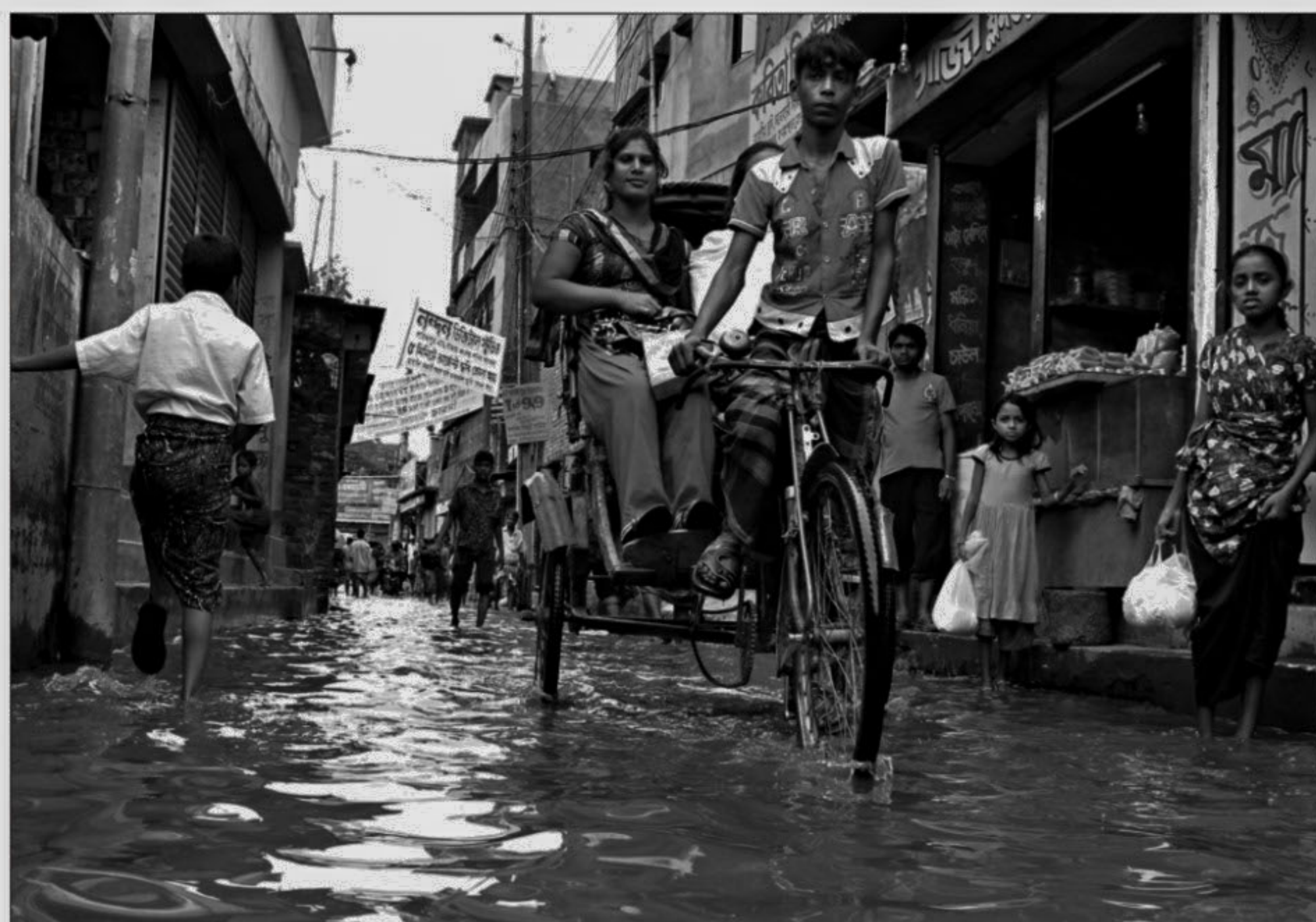
Water from rain during the last two days could not drain out resulting in the waterlogging of Govindpur Bazar at Shanir Akhra in the city yesterday.