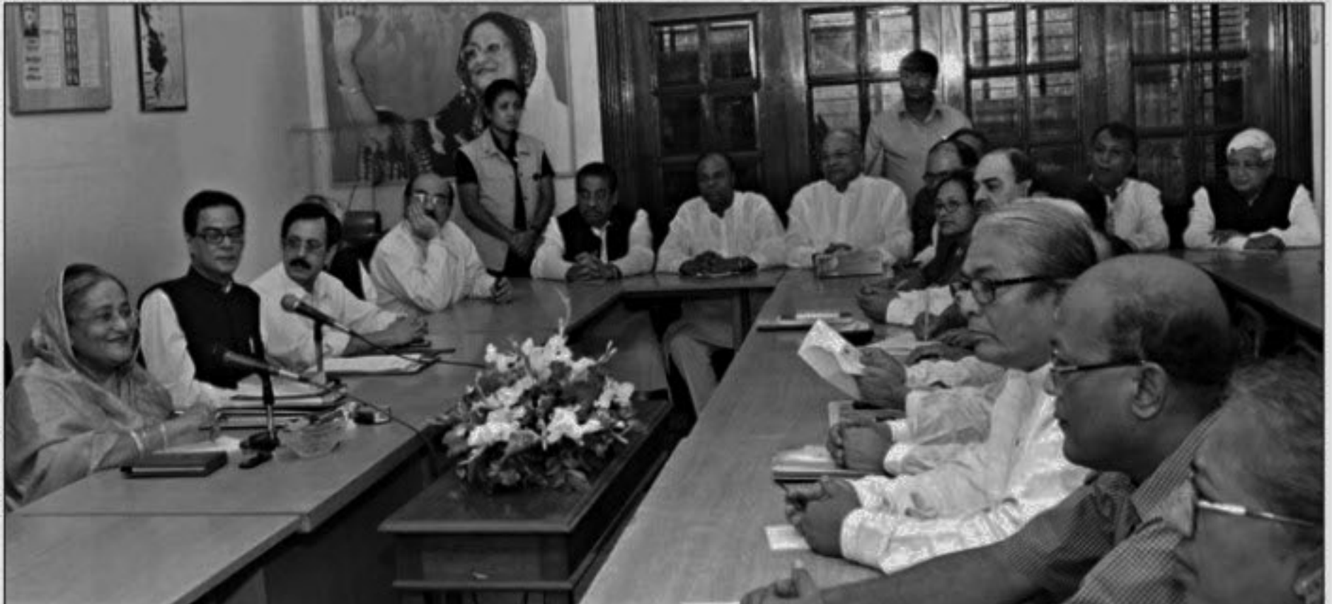
Prime Minister and Awami League President Sheikh Hasina addresses the party's central working committee meeting at her political office at Dhanmondi in the city yesterday. (Story on Page 1)