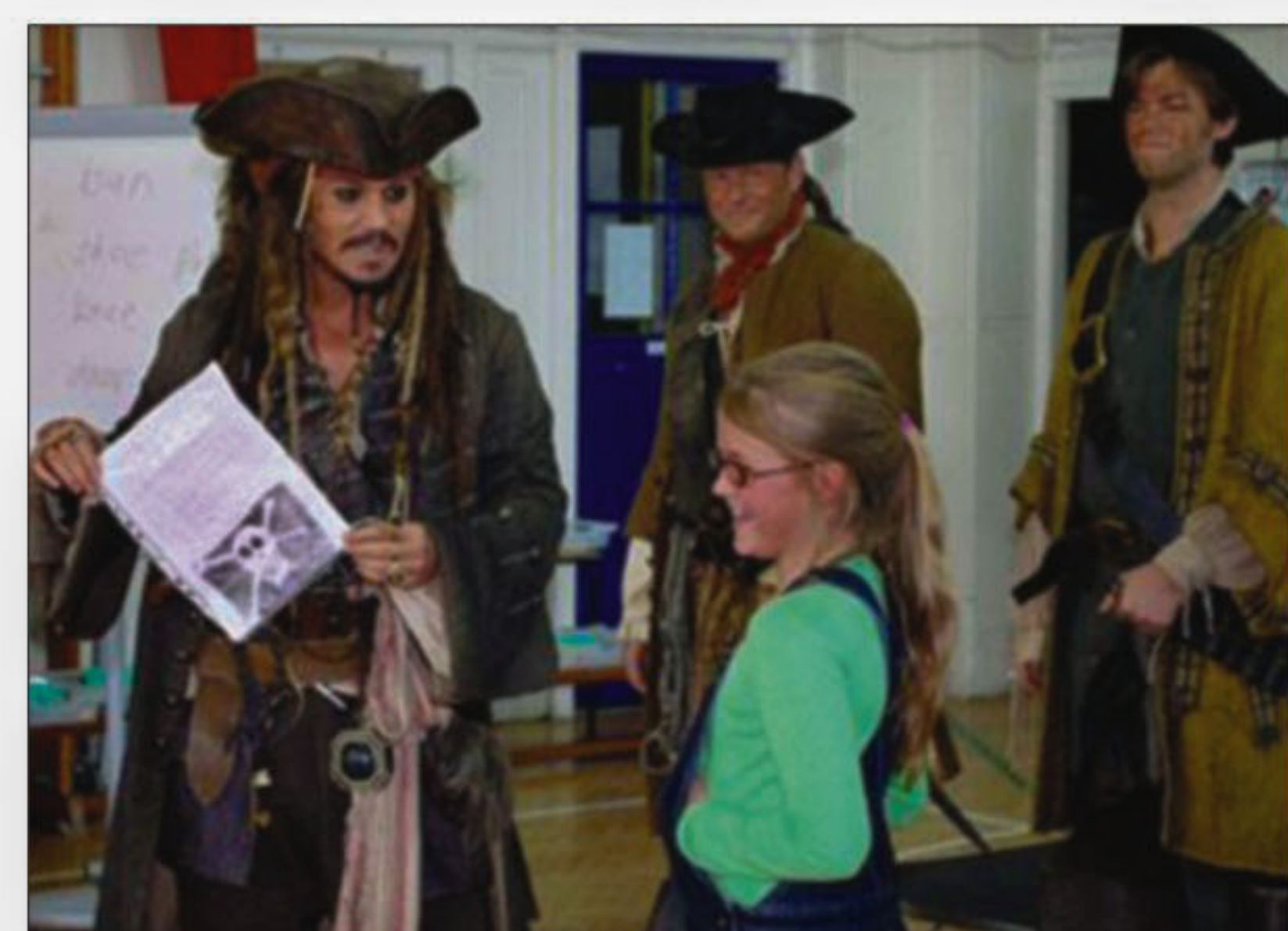
Johnny Depp is filming the latest "Pirates of the Caribbean" instalment at the Old Royal Naval College in London.