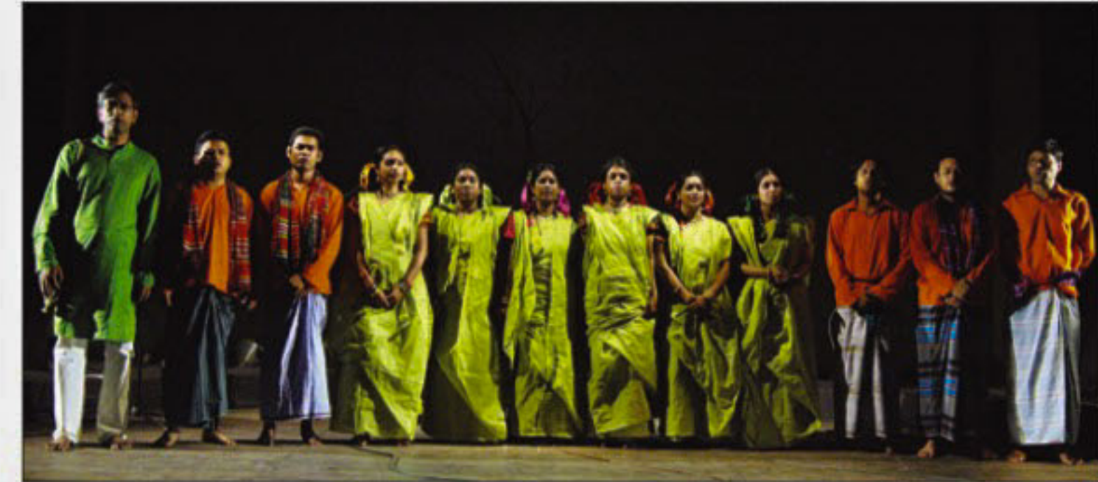
The three-day event featured recitation-based productions staged by artistes of Boikuntho.