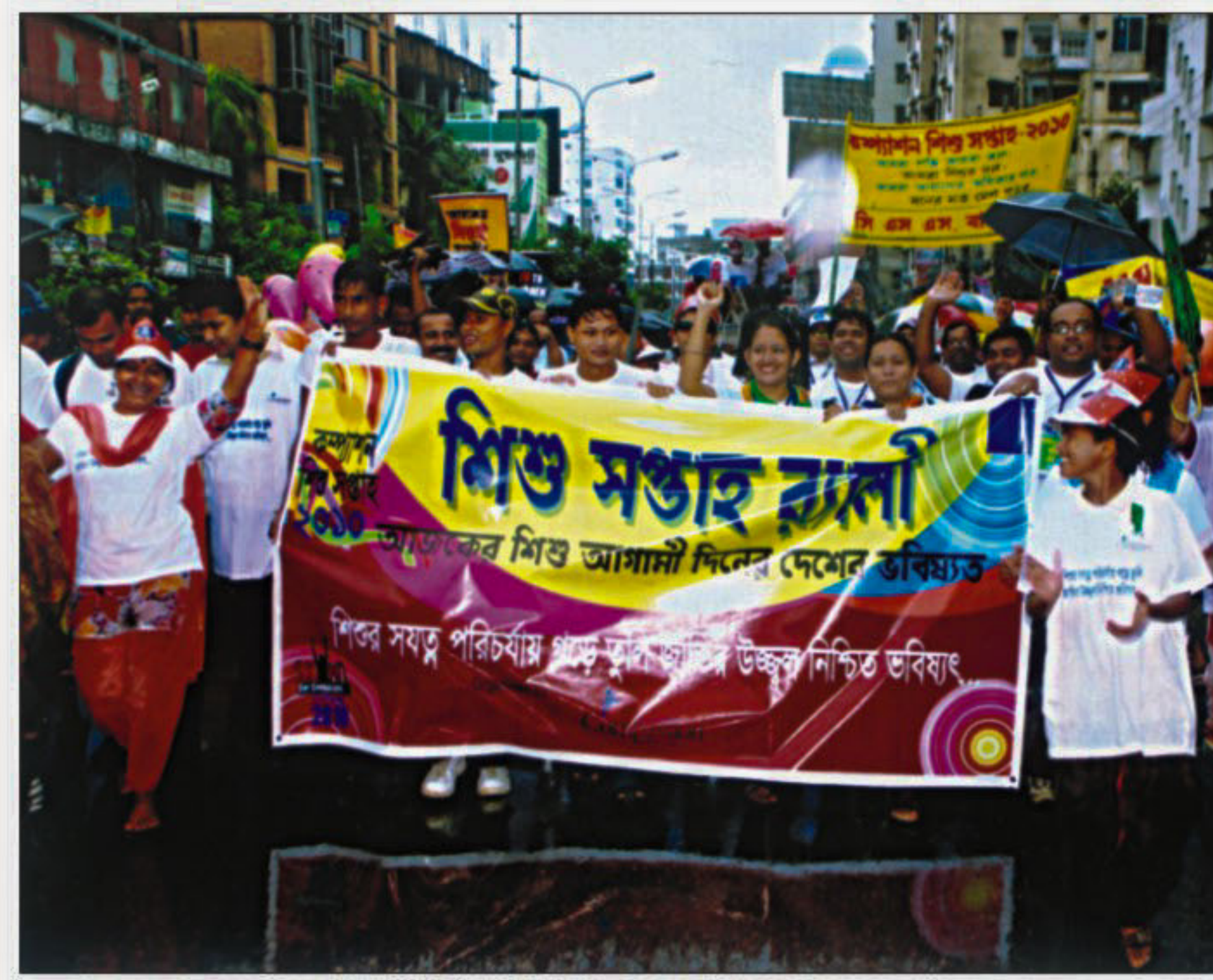
A rally was brought out from the city's Manik Mia Avenue celebrating Children's Week that ended yesterday. Compassion International-Bangladesh, an NGO, organised the rally.