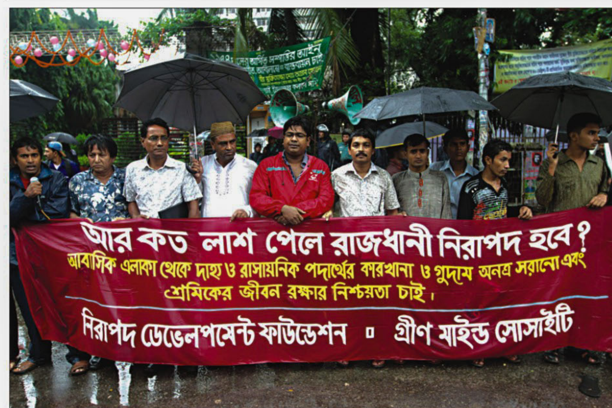
Nirapad Development Foundation and Green Mind Society jointly form a human chain in front of the National Press Club in the city yesterday expressing condolence at the deaths in the Wednesday's Jatrabari fire and demanding removal of chemical factories and warehouses from residential areas.