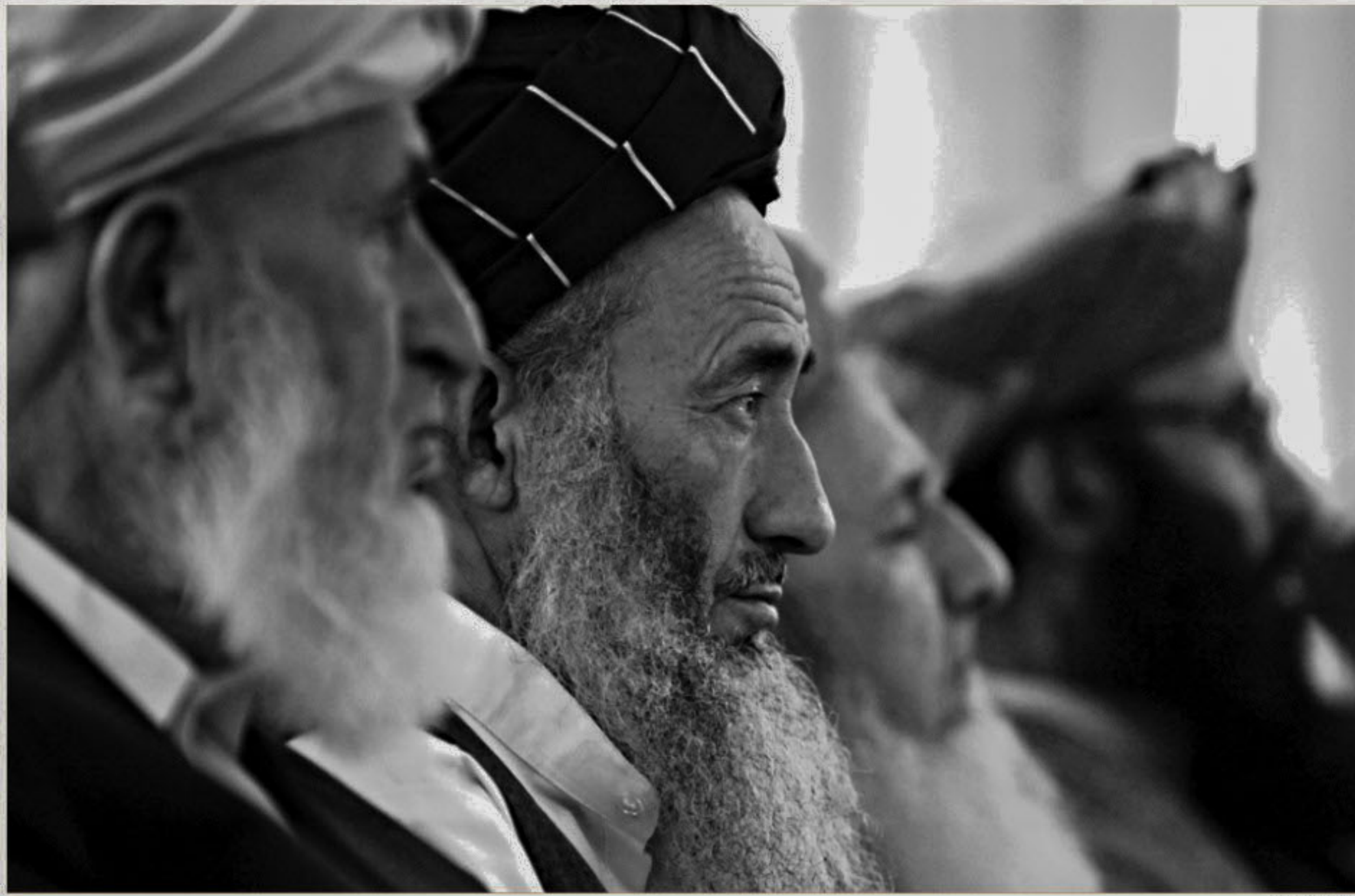
Members of the peace council listen to Afghan President Hamid Karzai speak during an inaugural meeting at the Presidential Palace in Kabul yesterday. Karzai inaugurated the council appointed to broker peace with the Taliban and other insurgents fighting for nine years against his administration.