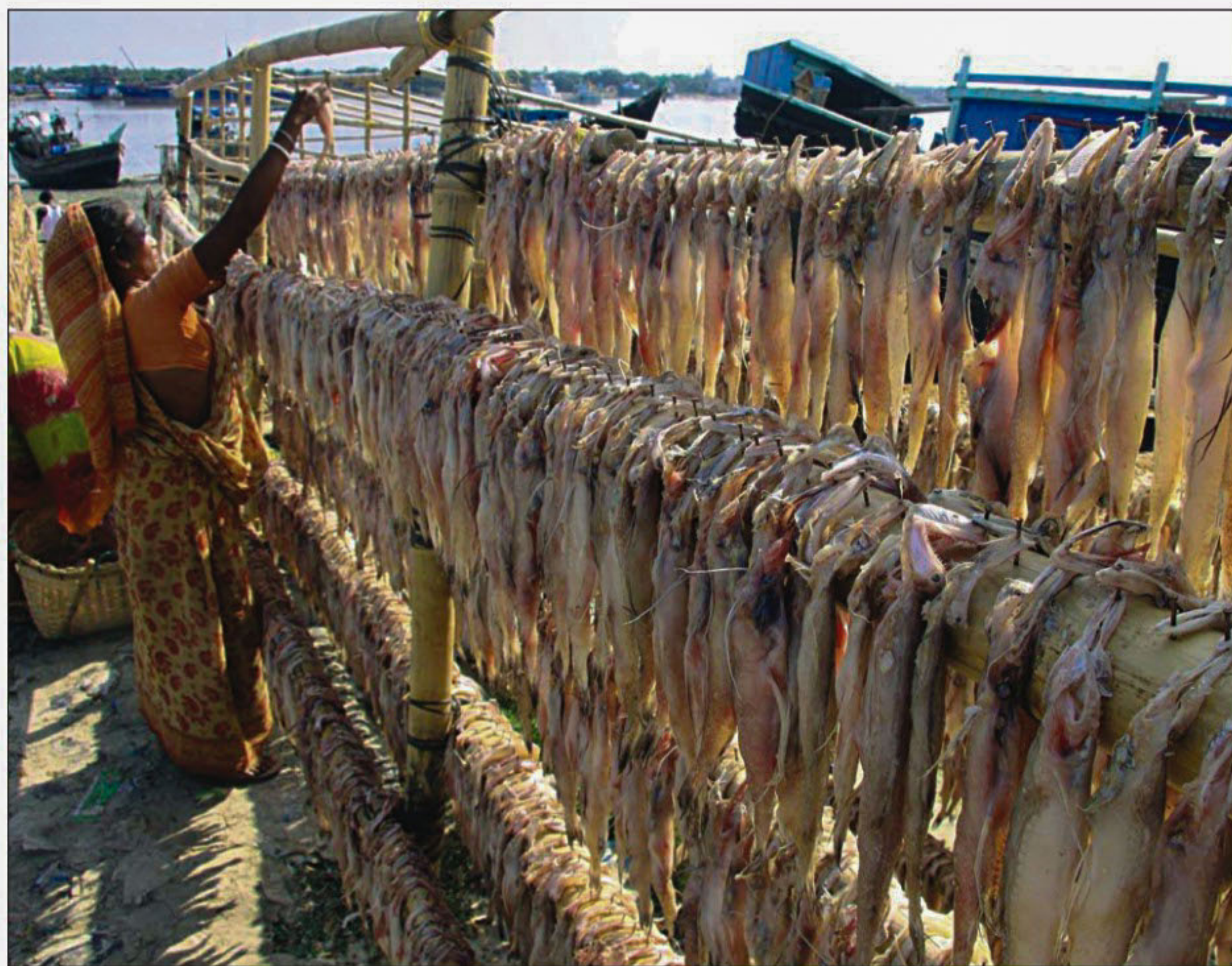
A woman sun-drying sea fish laitya at Chaktai along the Karnaphuli River in Chittagong. The area, famous for preparation and processing of a large amount and variety of dried fish, supplies the item to different parts of the country.

Of the charge-sheeted accused, four were later released on bail while Masudur Rahman is now in jail.