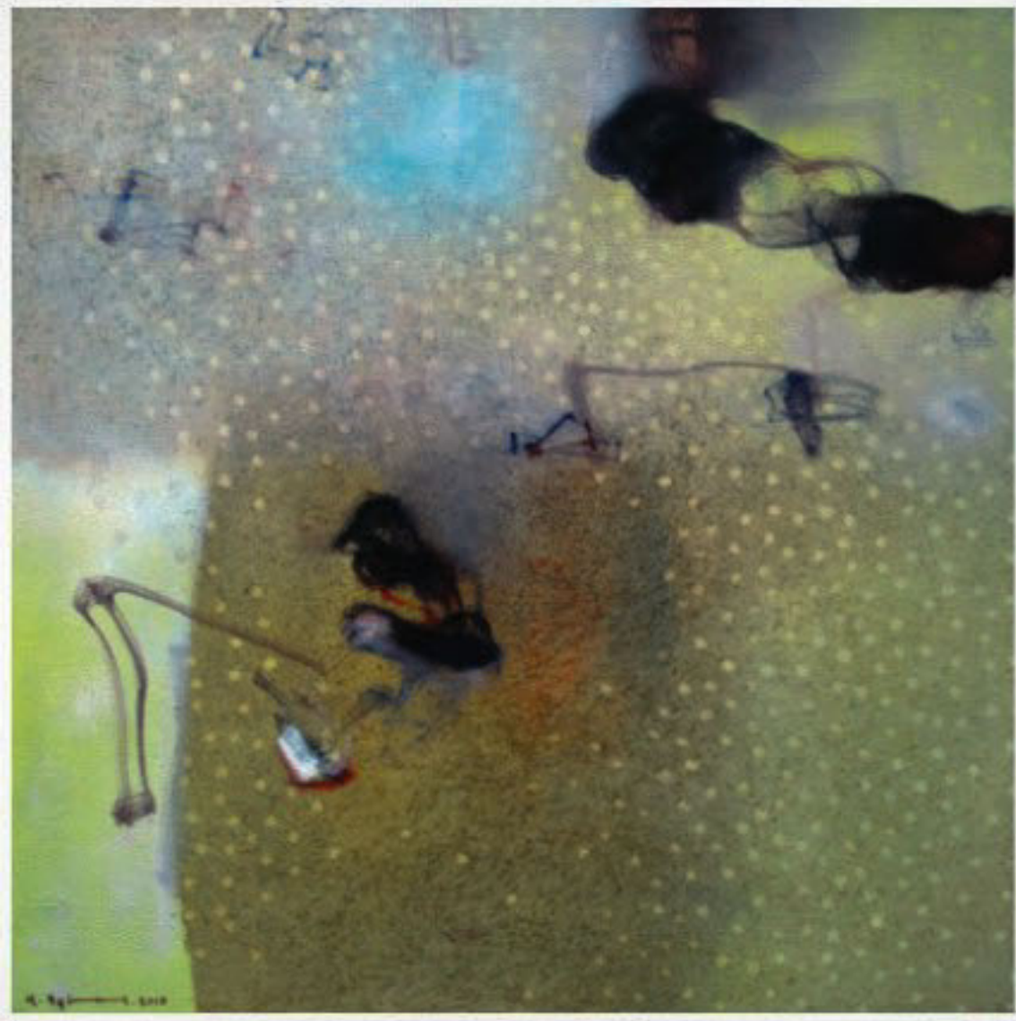
Original Space -2