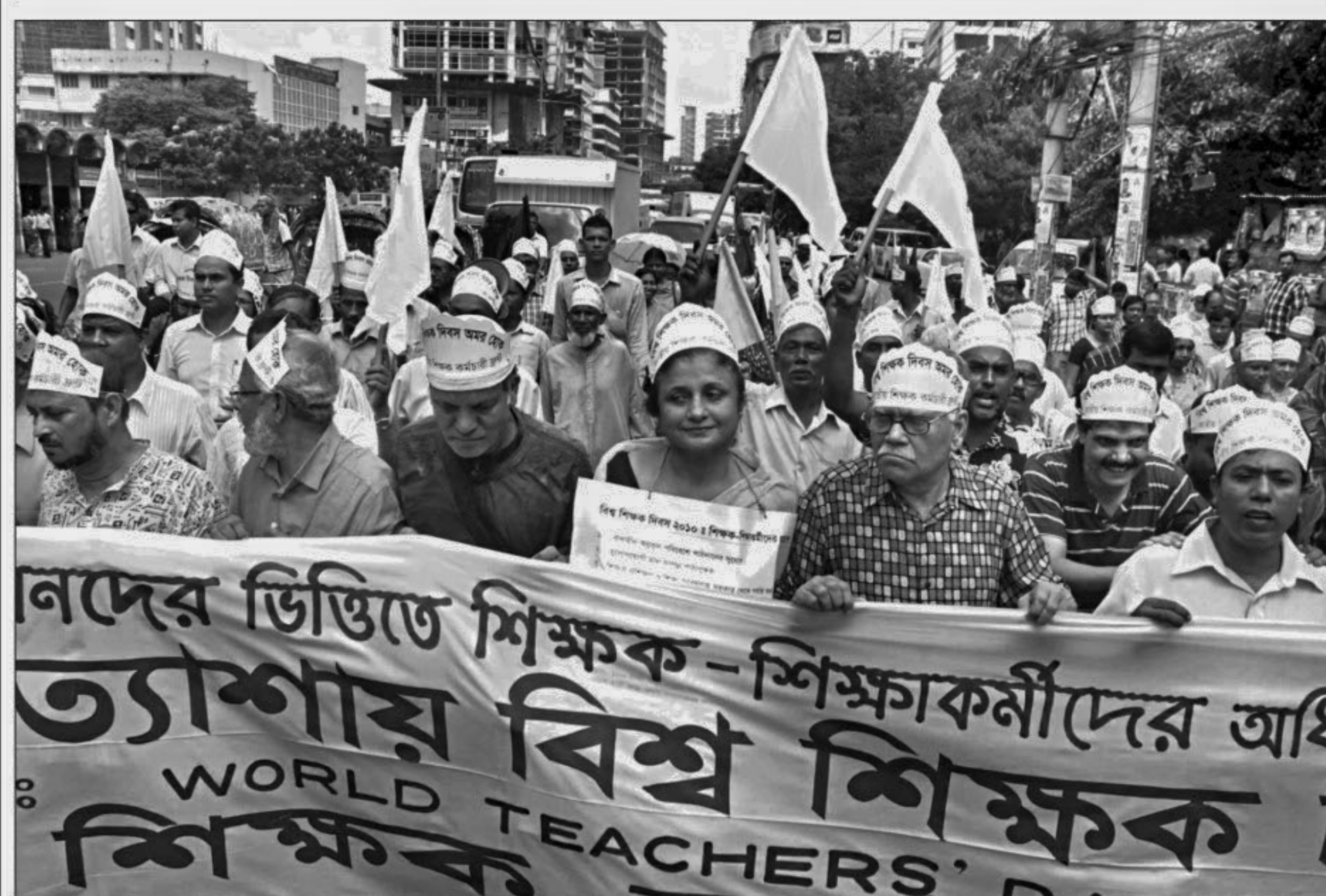
Shikhhak Karmachari Oikya Parishad brings out a procession from the city's Muktangan yesterday on the occasion of World Teachers Day.