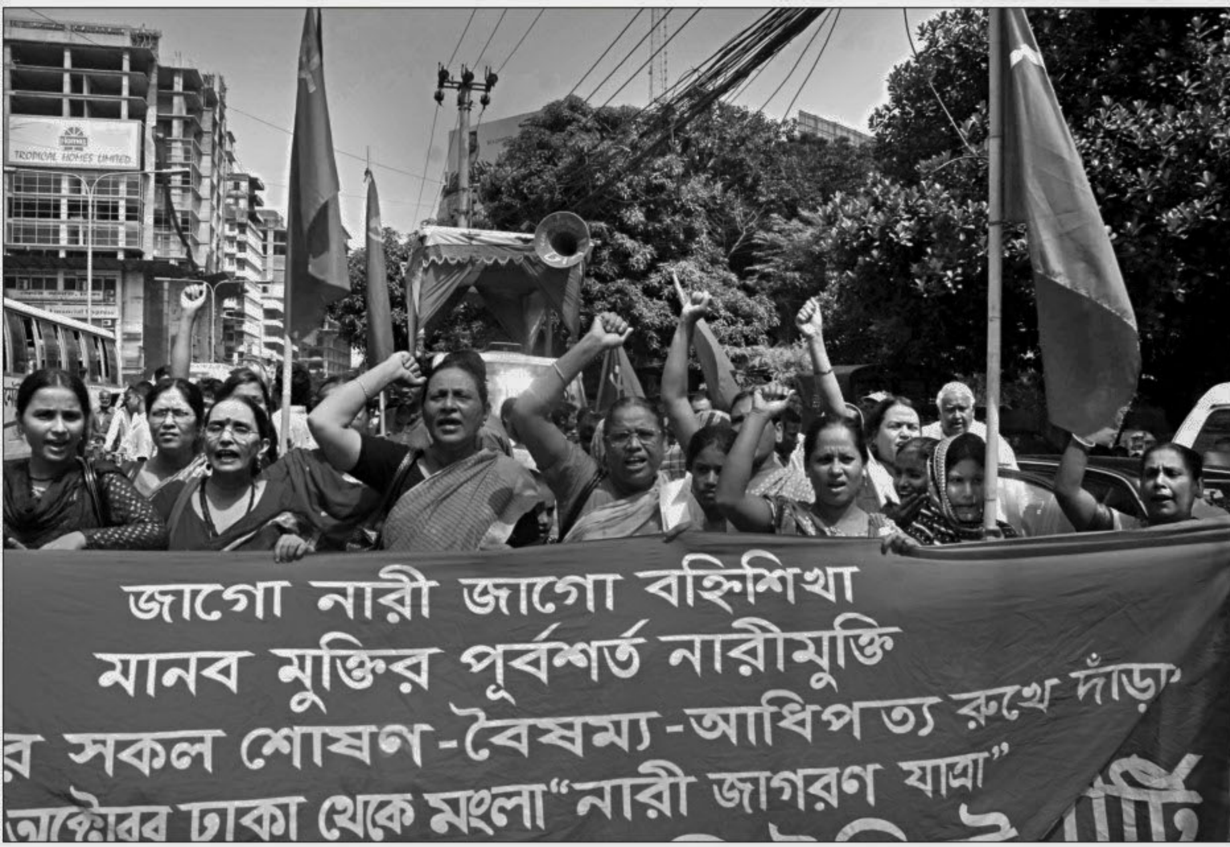
Communist Party of Bangladesh brings out a procession, scheduled to end at Mongla, from the city's Muktangan yesterday demanding an end to oppression and discrimination against women.