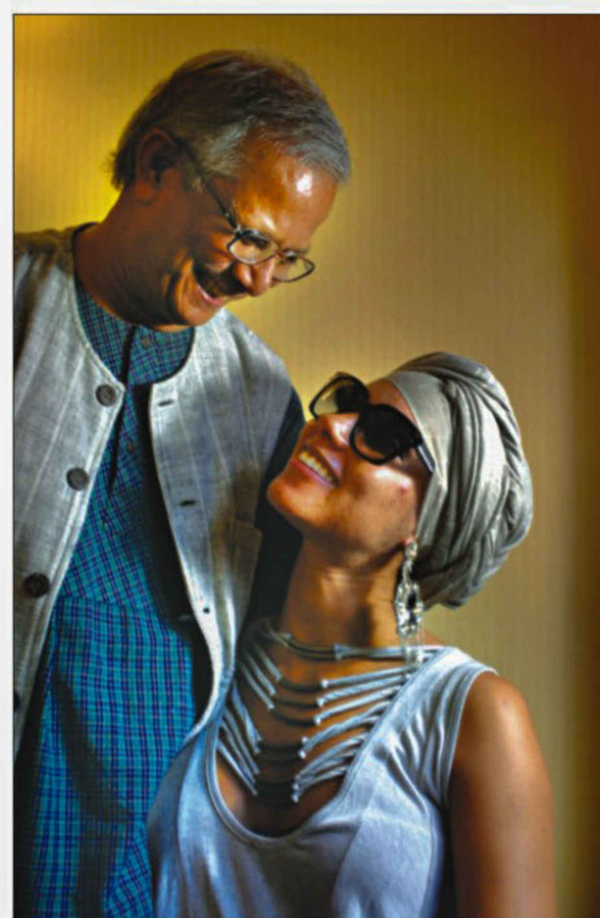
Alicia Keys (right) with Professor Yunus.

Keys' debut album, "Songs in A Minor", earned her five Grammy Awards in 2002, including Best New Artist and Song of the Year for "Fallin'." Her second studio album, "The Diary of Alicia Keys" fetched her additional four Grammy Awards in 2005. Her third studio album,